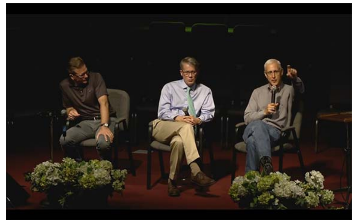
During the Q&A Part of the Conference