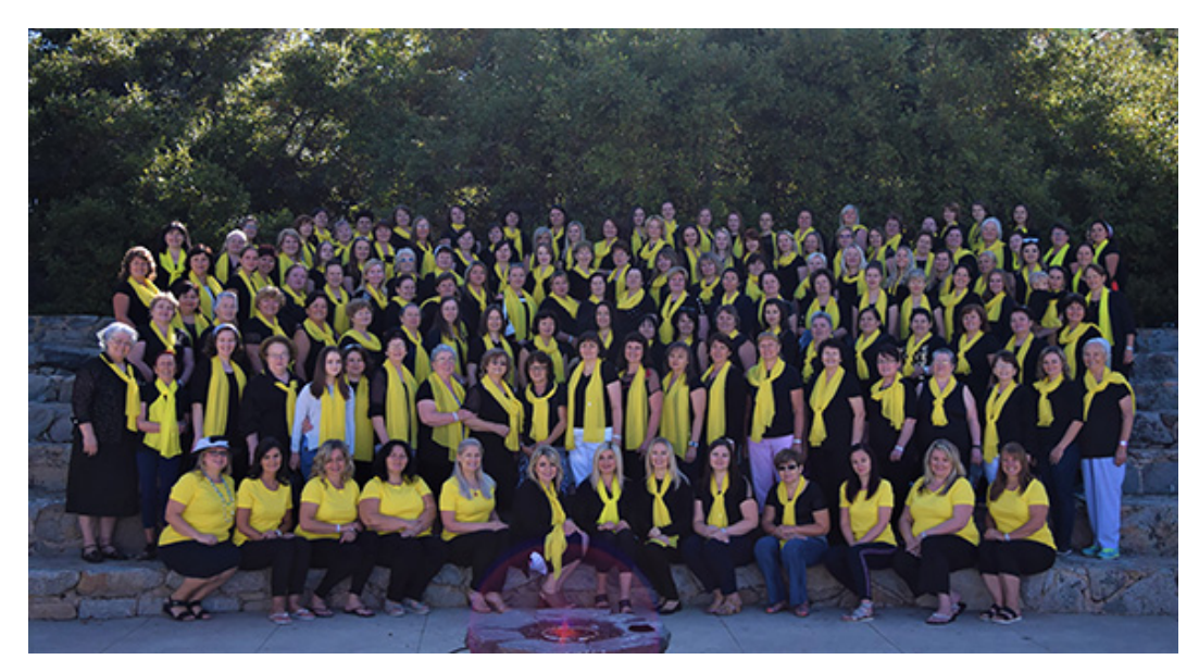
The Retreat's Attendees