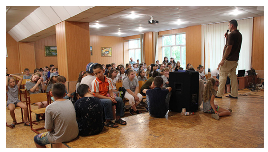
Camp in Ukraine