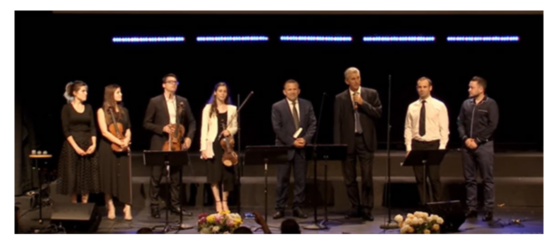
During the concert in Rock-Land church