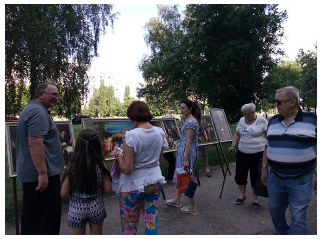
Outreach on the streets of Kharkov