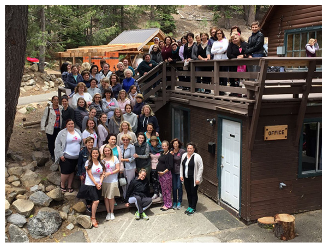
"Moms in Prayer" retreat attendees