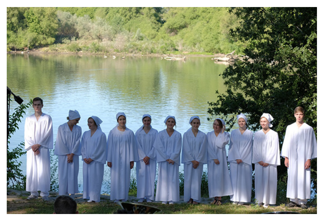
Eleven young people ready to make a covenant with the Lord

The recording of a live broadcast of the event may be found on the <u>YouTube channel of</u> <u>Bryte Church</u>, and the description <u>of the celebration and the pictures are uploaded to the</u> <u>Association's website (click here).</u>