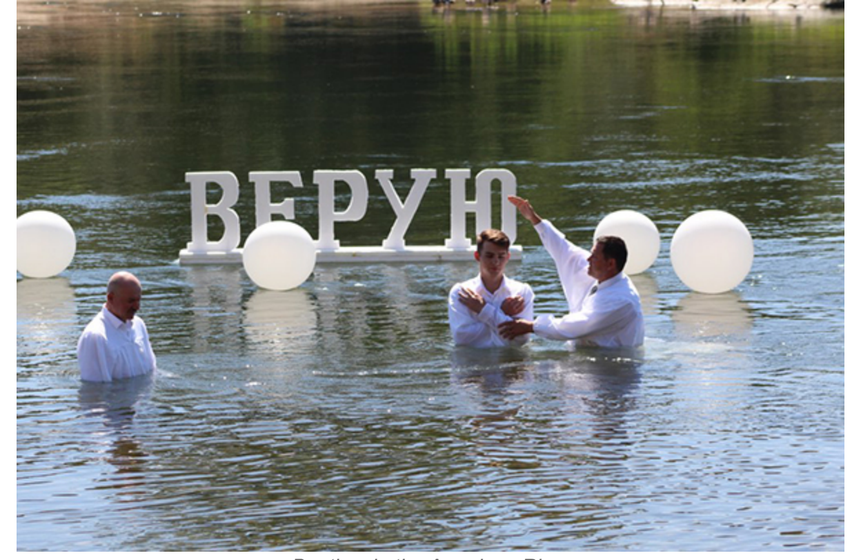
Baptism in the American River