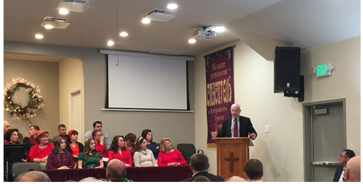
Church at Hayward