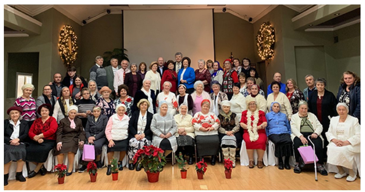
A ten-year anniversary of widows and lonesome at Second Slavic Church

During the Christmas season, a few churches had various gatherings for widows and lonesome. For more about these gatherings read an article located on <u>the Association's</u> <u>website – click here (in Russian.)</u>