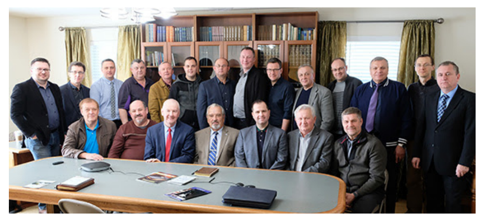
The Meeting Attendees

Moldova's leaders were present physically and virtually for this meeting. There were also representatives from missions and those responsible for the planting of Russian-speaking churches of Europe. For more information <u>read on the Association's website – click here.</u>