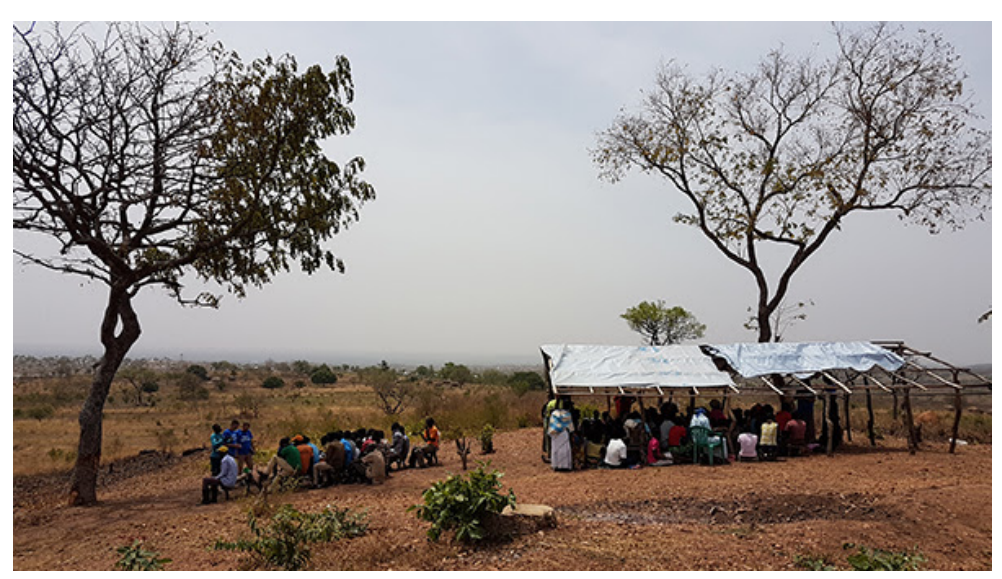
During the Studies