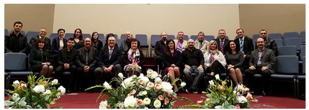
Part of the Seminar Attendees

For more about the seminar, <u>read on the Association's website – click here (In Russian only.)</u> Recording of an interview with the speakers will be available later on the Association's website under the "Resources – Radio Programs of 2019" section.