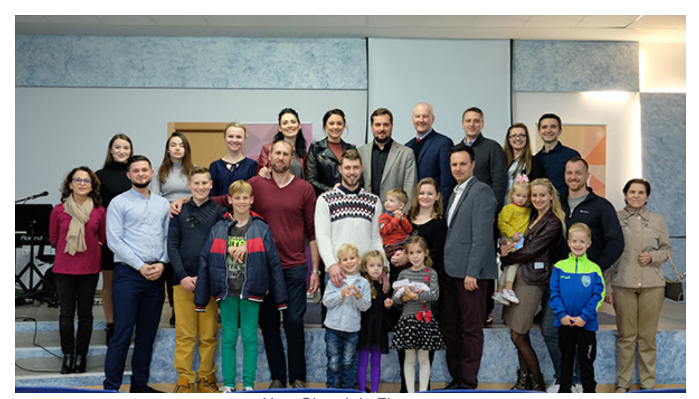
New Church in Florence