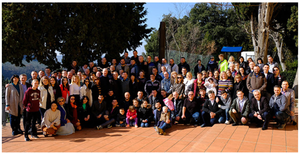
The Summit Attendees