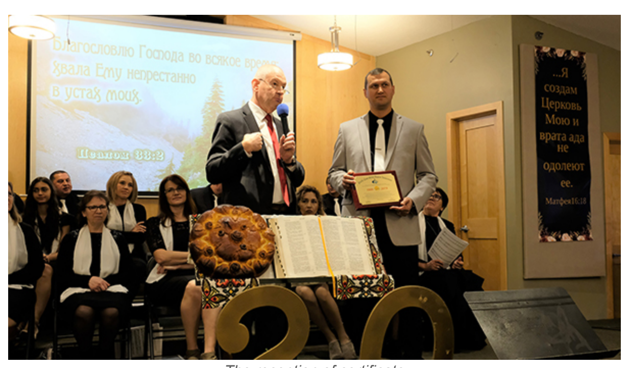
The reception of certificate

the founders of the church, attended this celebration, gave them a certificate of commemoration, and ministered through his preaching. Read his article, which is accompanied by pictures on the Association's website – click here (in Russian only.)