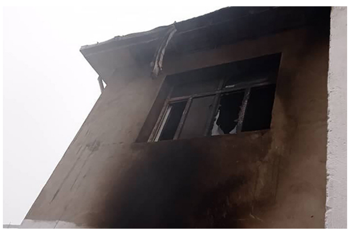
This is what the Center of Hope looks like now.

The Mission is asking for help at the time of this distress, and for any financial help possible. The address to send donations, <u>can be found in the same article – click this link.</u>