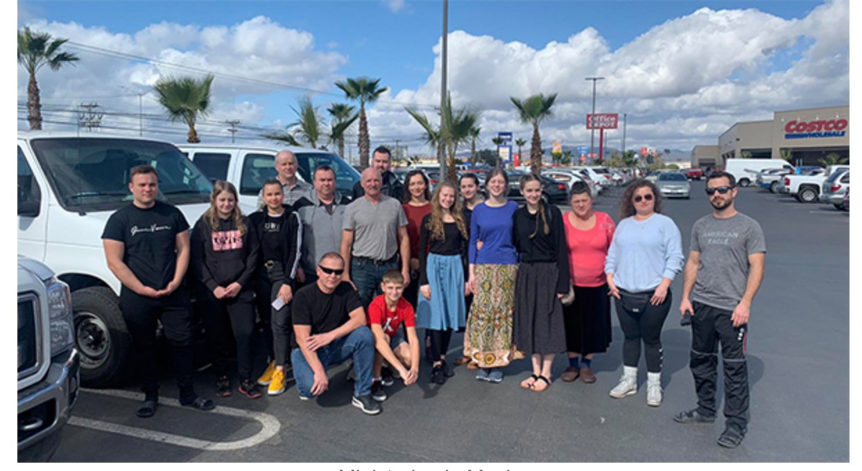
Ministering in Mexico