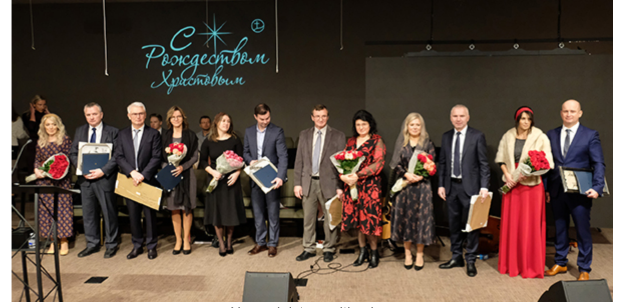
New ministers with wives