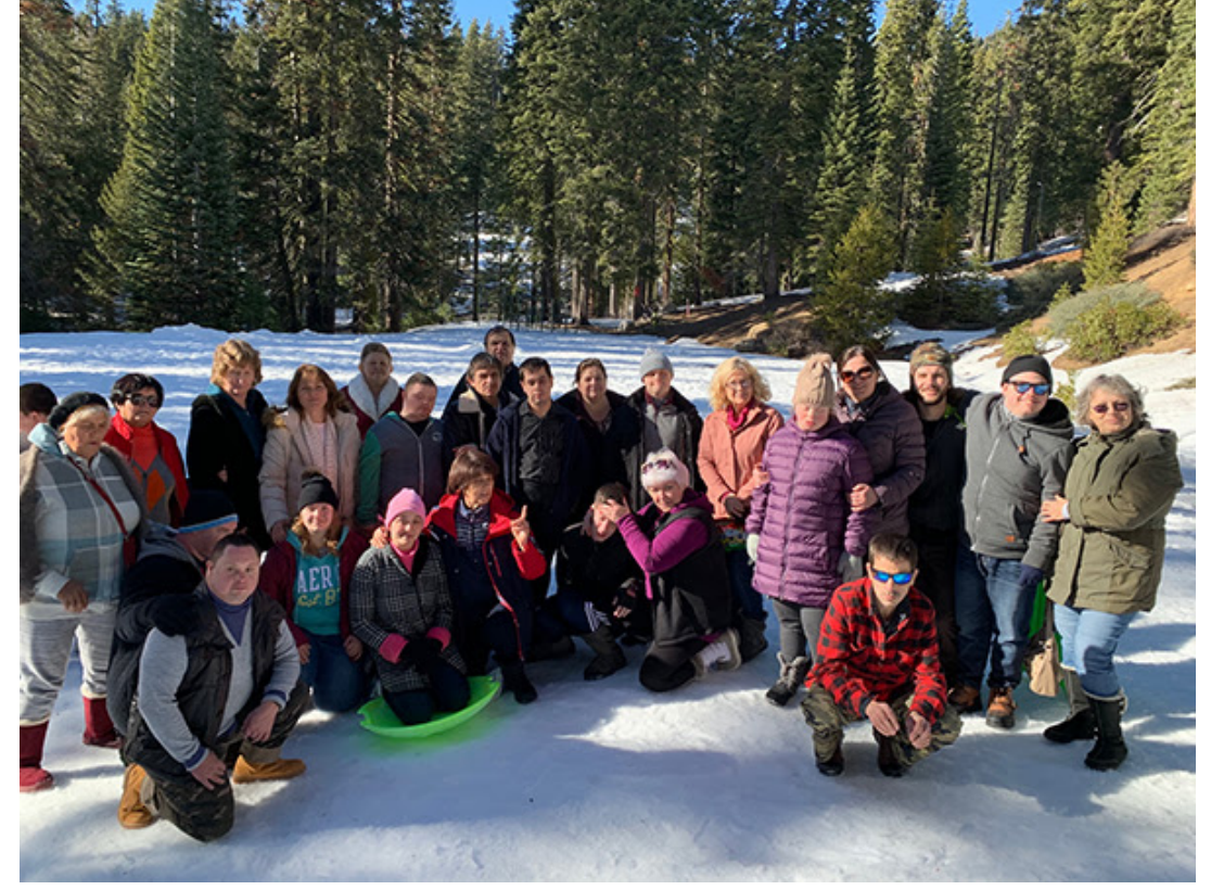
Enjoying the snow