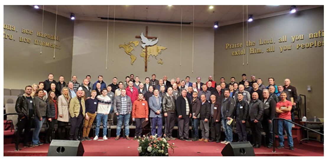
Church Safety Conference Participants

Although the question of safety is not taken very seriously in the Slavic churches, the conference was still attended by about a hundred people who found the conference to be very informative and beneficial.