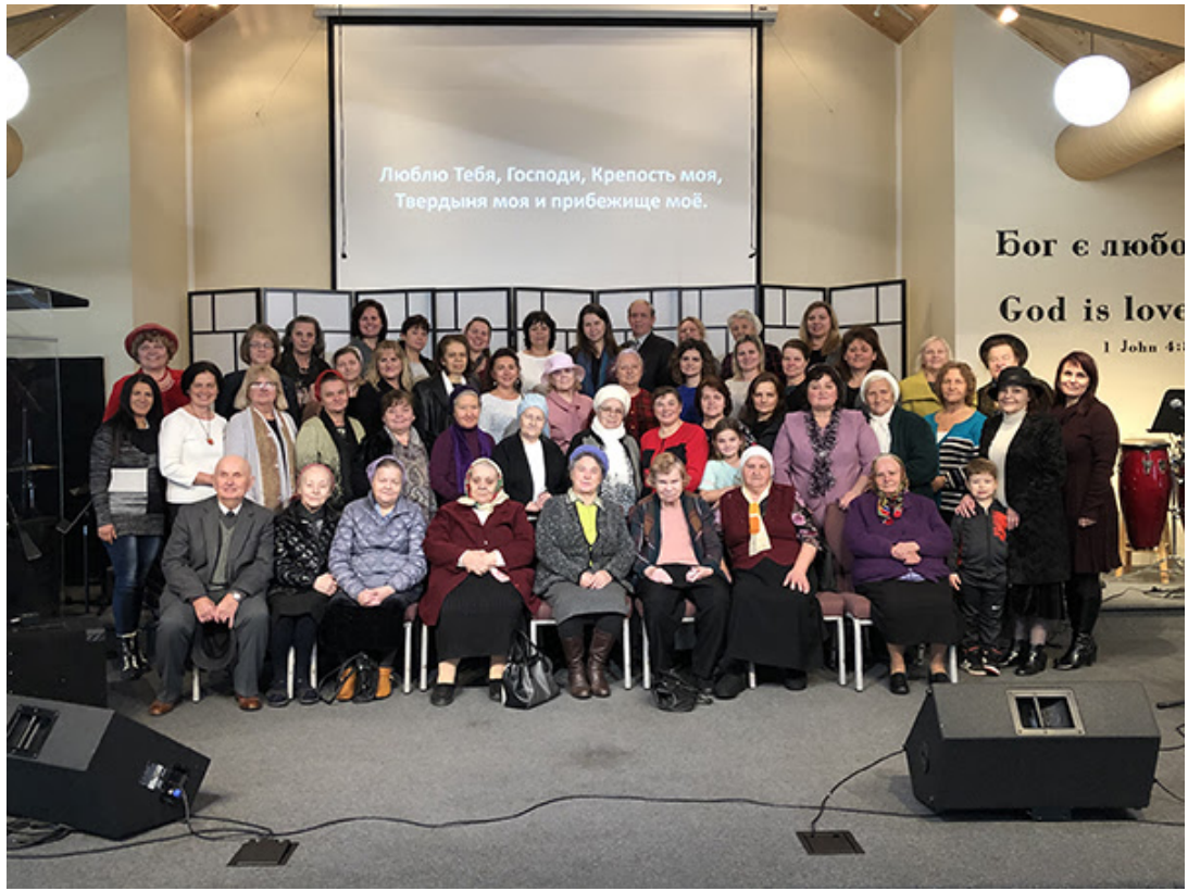
Sisters, Conference Particip

theme of the conference was "God is my Strength and Protector in Distress" <u>The article can be</u> accessed here (in Russian only.)