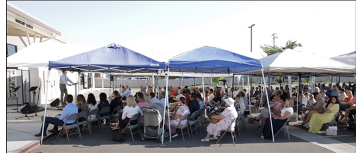
Sunday service at Grace Family Church