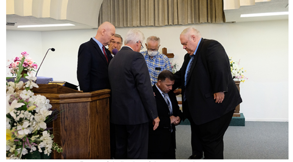
Prayer of dedication of the new head pastor