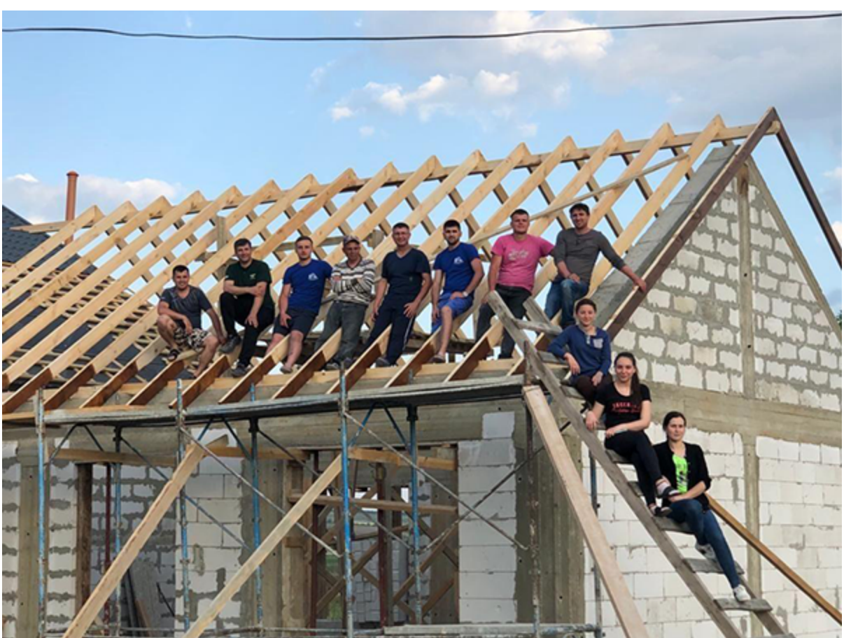
Bozen, Moldova. Together, brothers and sisters build the house of prayer

The Bible Slavic Mission talks in their newsletter of the incredible work of God. Because of the global pandemic of the 2020, it became impossible for the building teams from Germany and the U.S. to travel and enter various countries and missions' fields. However, armed by faith and boldness, the local churches began local building of the houses of prayer and Centers of Hope. They are trained and inspired by the previous building projects. The faithfulness and the unity of the brothers and sisters overcome the boundaries of countries and even continents. Read more about it here (in Russian only.)