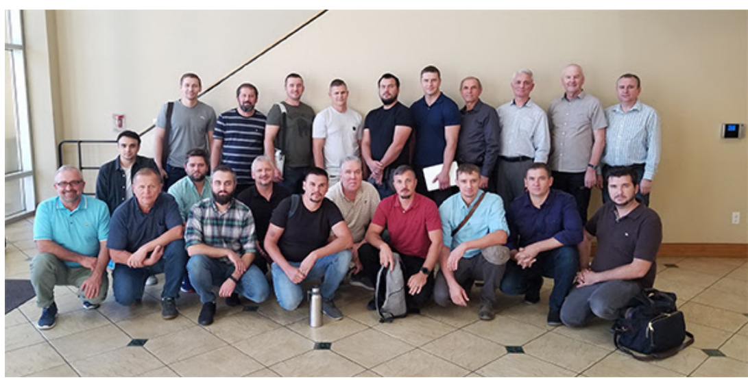
Students at Bryte Church Campus

Apparently, the pandemic had very little effect on this ministry. The teaching sessions continue, and the instructors began to come even from far countries like Belarus. For more about the ministry, <u>read an article on the Association's website – click here</u>.