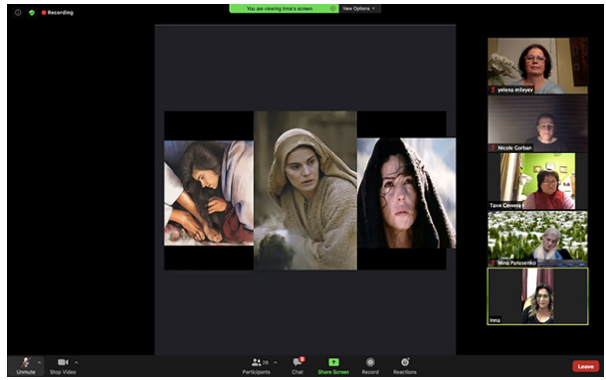
Women of Easter