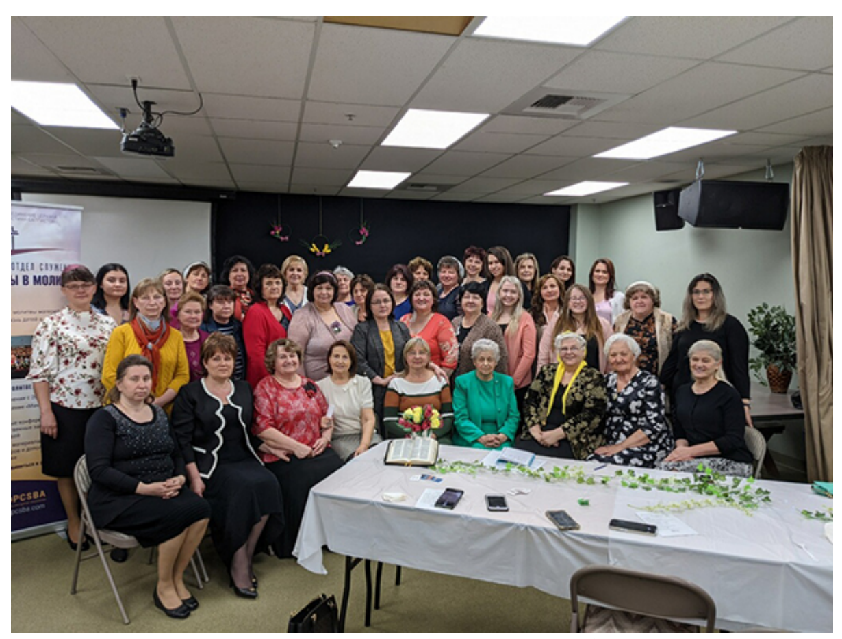
Women Participants of the Prayer Breakfast