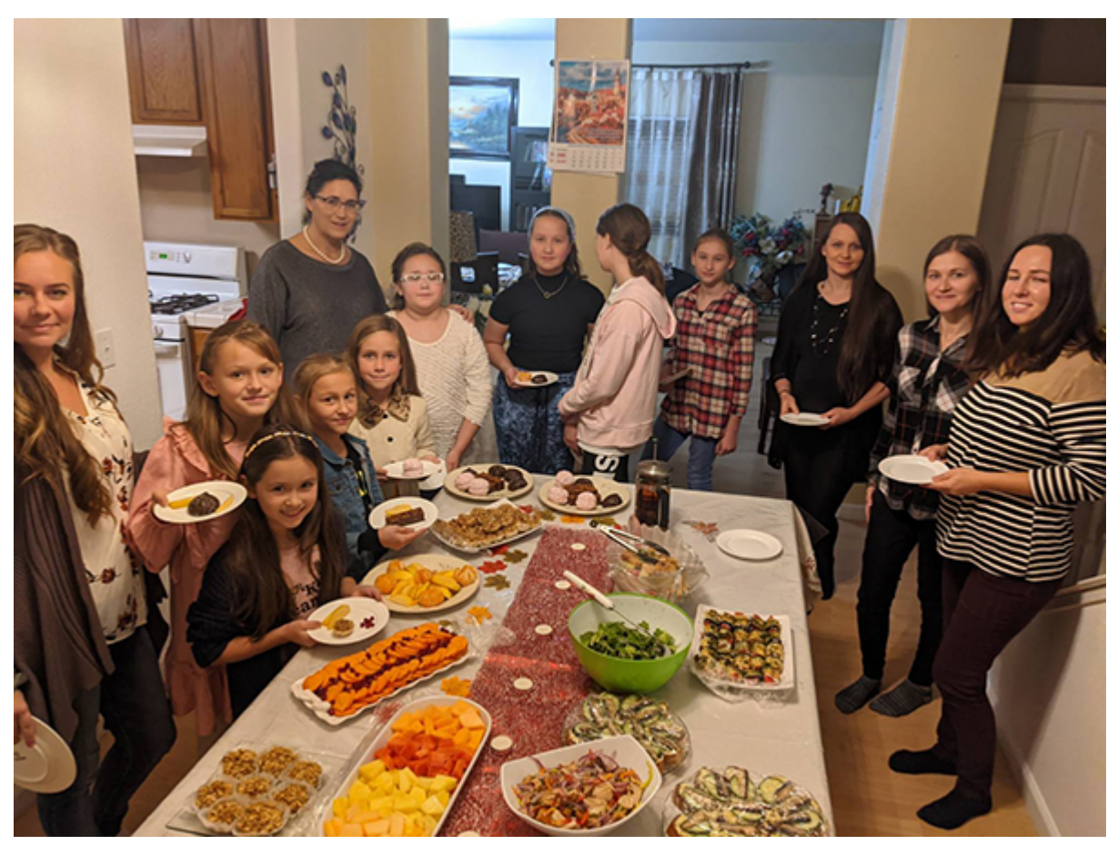
Younger and Older Participants of this Wonderful Ministry