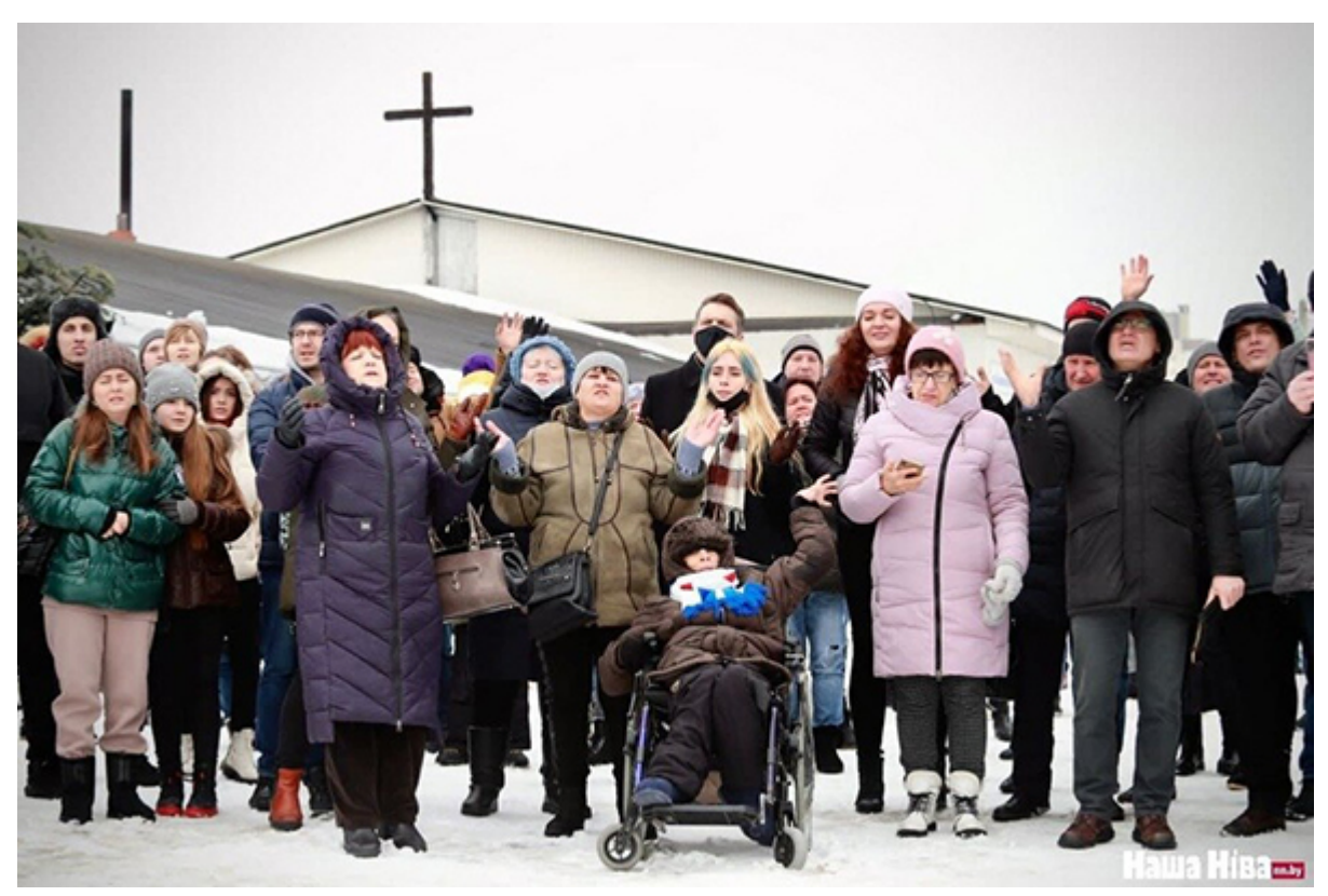
Church Praying Outside