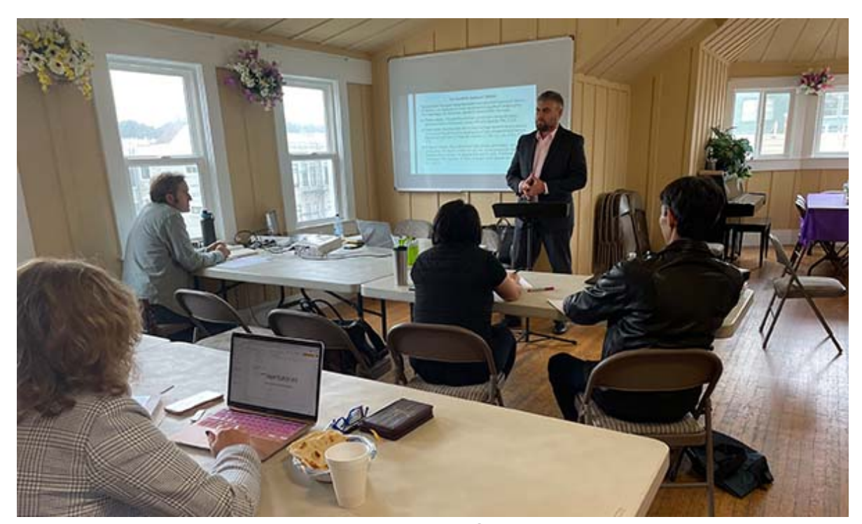
Lesson at a church in San Francisco

leading this department provides more information in his article which can be found on the Association's website – click this link (in Russian only.)