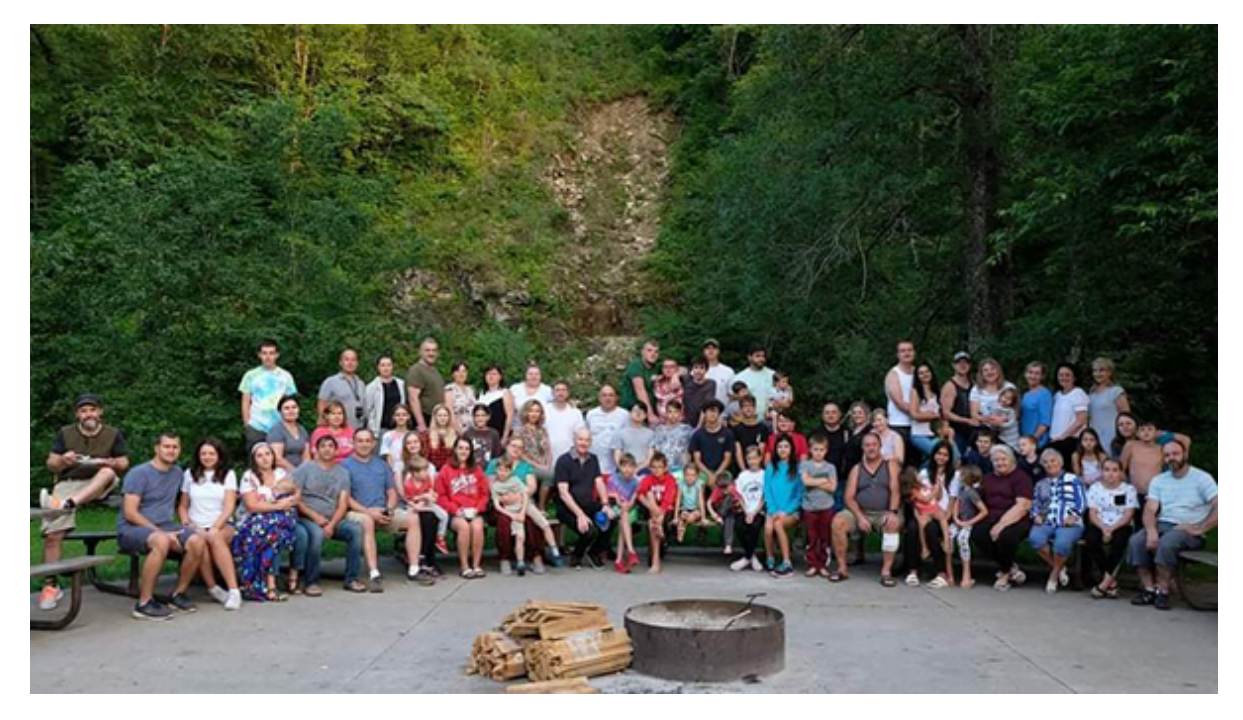
FAMILY CAMP IN SPAIN

From August 1-4, after a long wait during the pandemic, the Transfiguration Church in Minnesota had a wonderful opportunity to go on a retreat to the southern part of the State, to White Waters Park. For more about this camp, <u>read an article on the Association's website at this link (in Russian only.)</u>