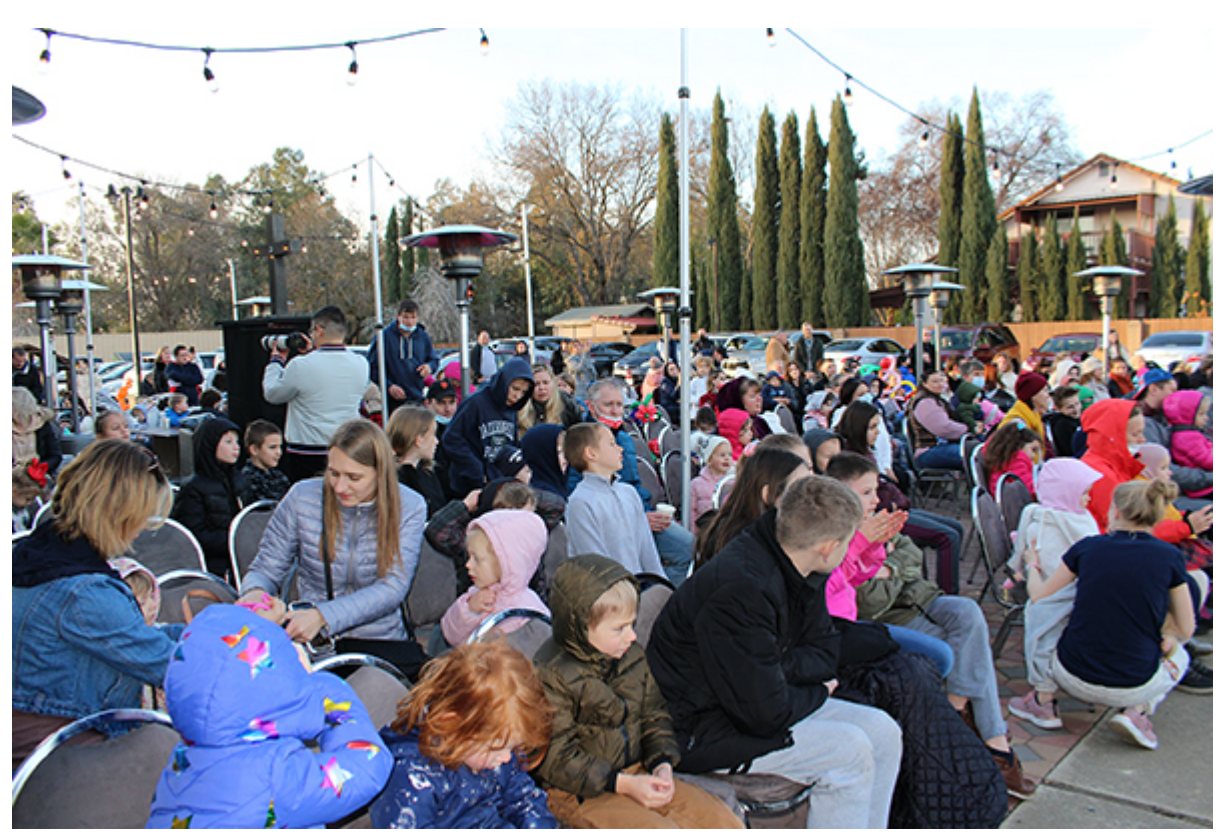
The Celebration was Especially Interesting for the Children