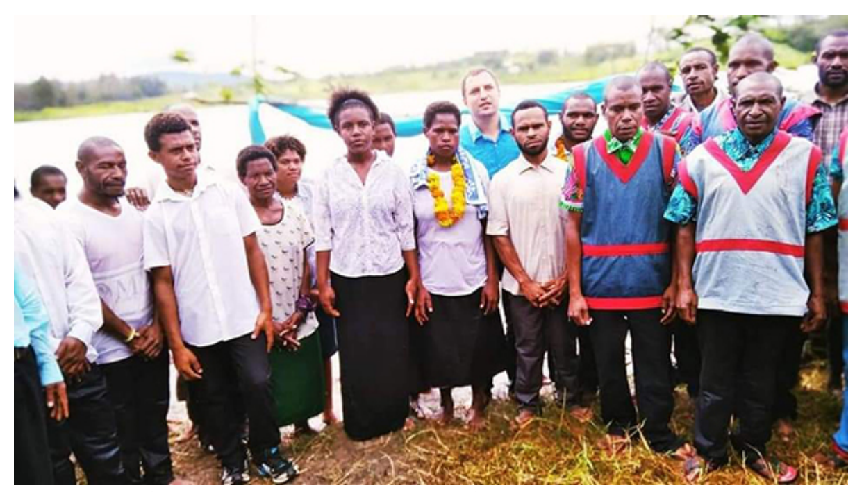
Seventeen People Were Baptized, Six of Whom Are Prisoners