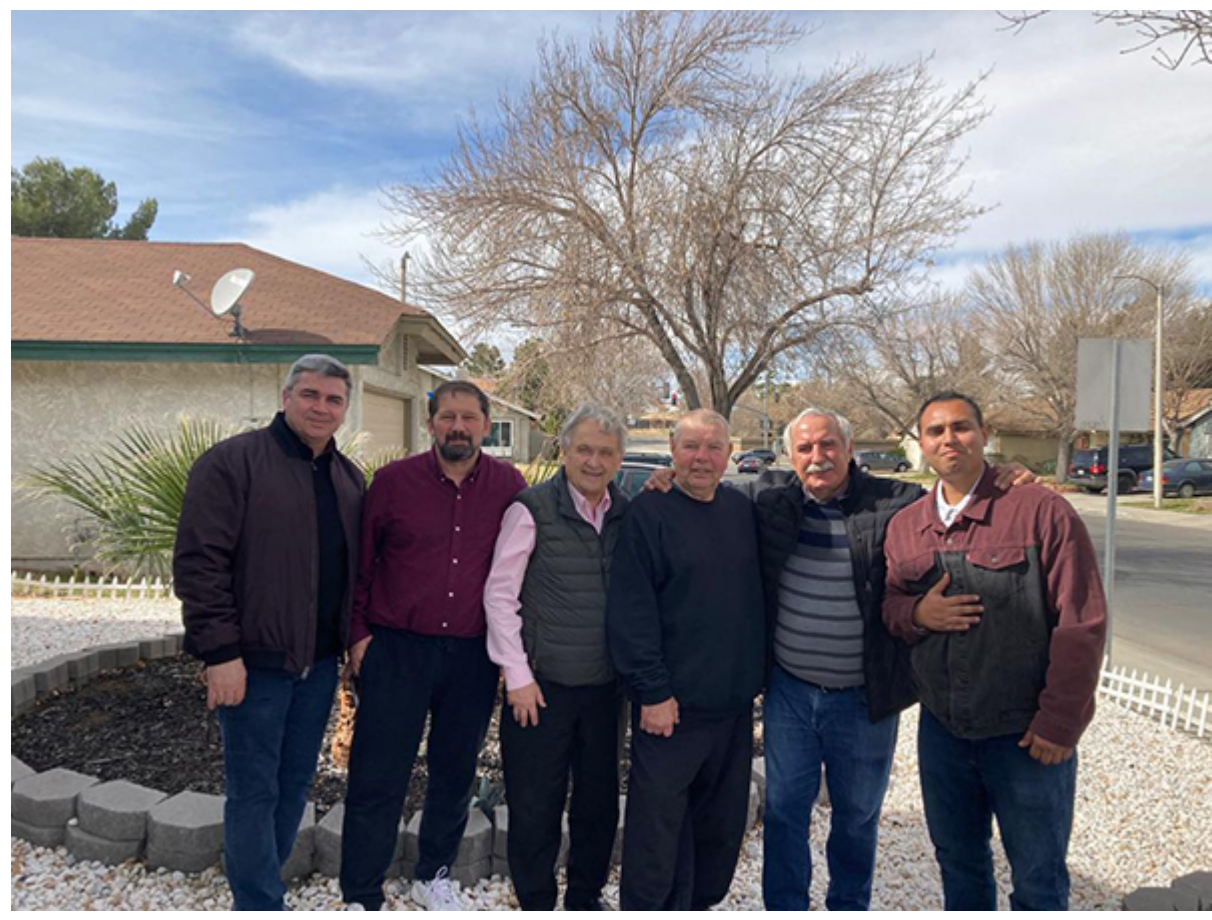
Part of the Ministry Team