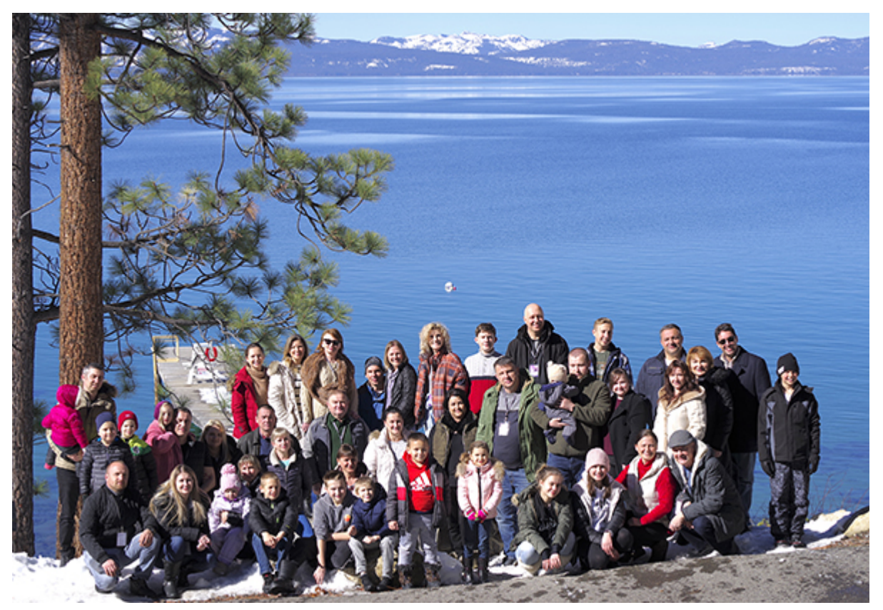
Both adults and children liked the retreat place very much