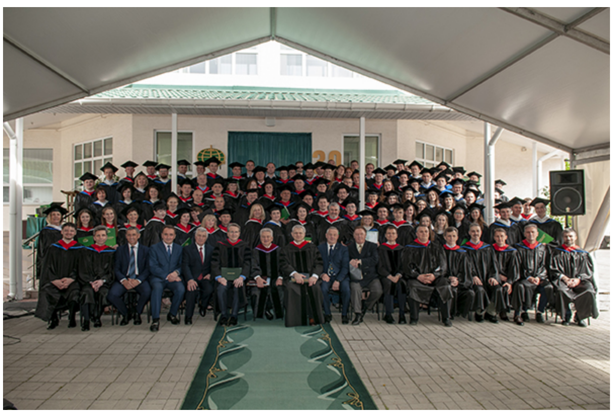
One of the 2021 Graduating Classes

Ukraine has always had an abundance of Christians and dedicated pastors. After the fall of the Soviet Union, there were new opportunities for ministry and the All-Ukrainian Union of ECB established their own seminary. This seminary trained thousands of people over the course of 30-year period and continues to provide theological training. For more about the celebration, visit the seminary's website – click here (in Russian only.)