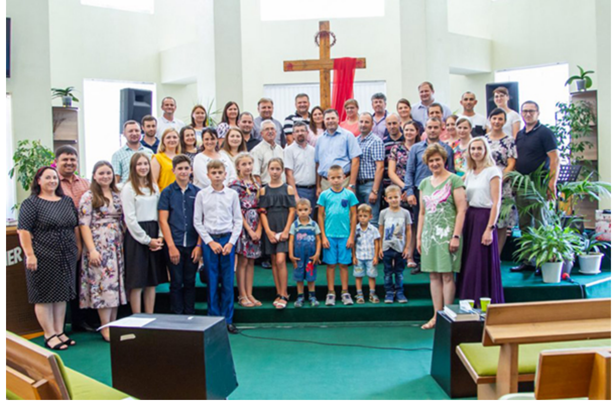
Keys Awarding Ceremony and the Recipient Families