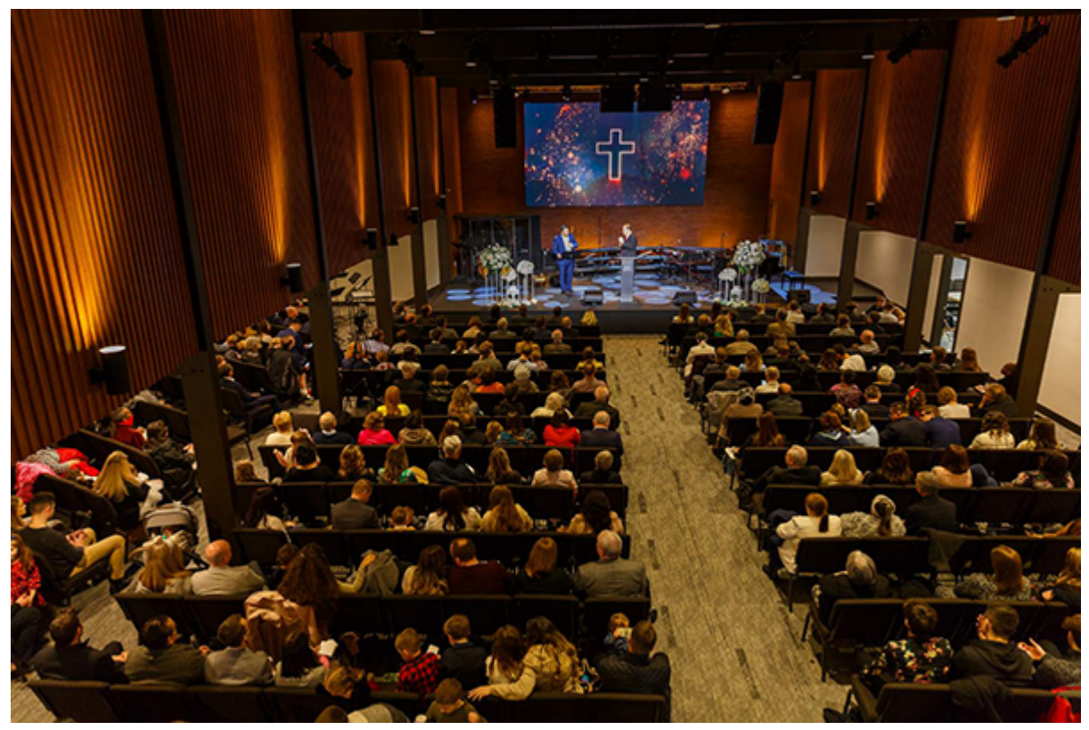
Church Service at the New Church Building