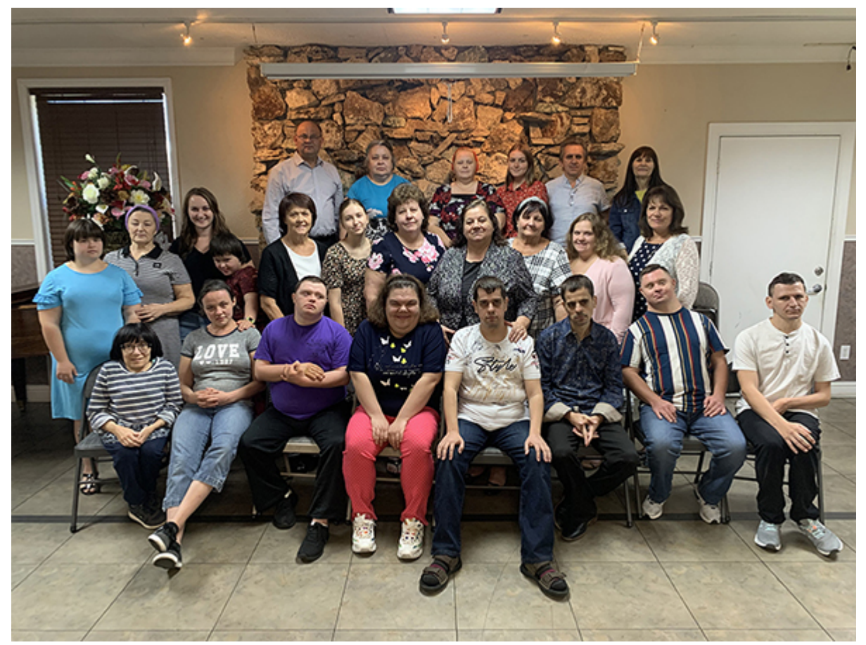
As always, after the end of the fellowship, it's time for a group photo