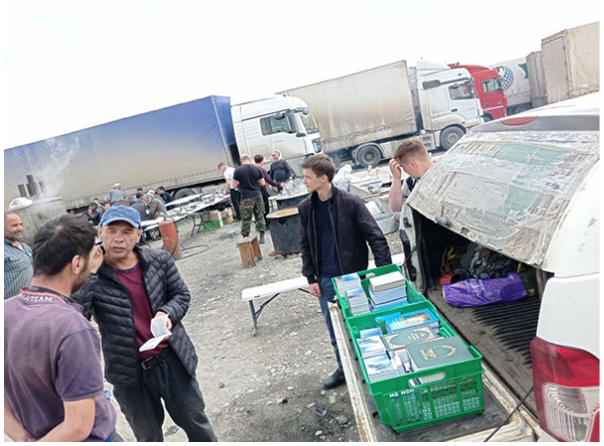
Who, Other Than God, Could Have Organized Such Evangelism!