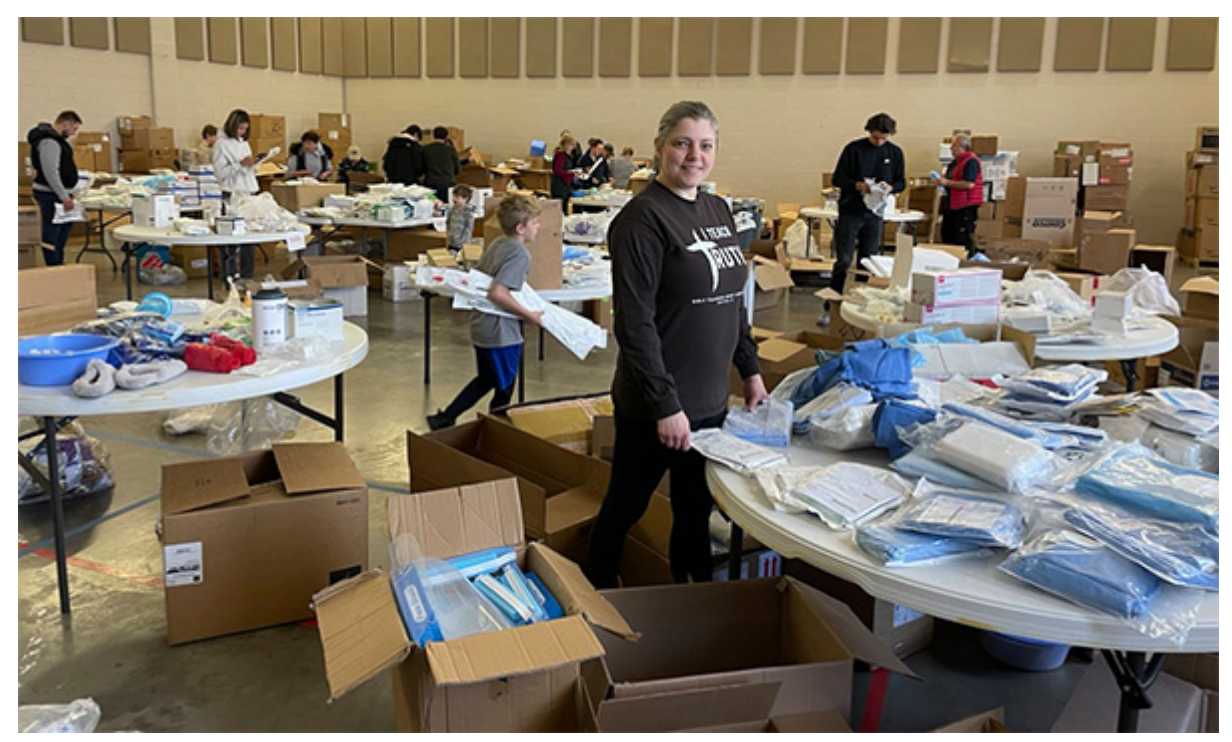
Sorting and Packing of the Medical Supplies for Ukraine