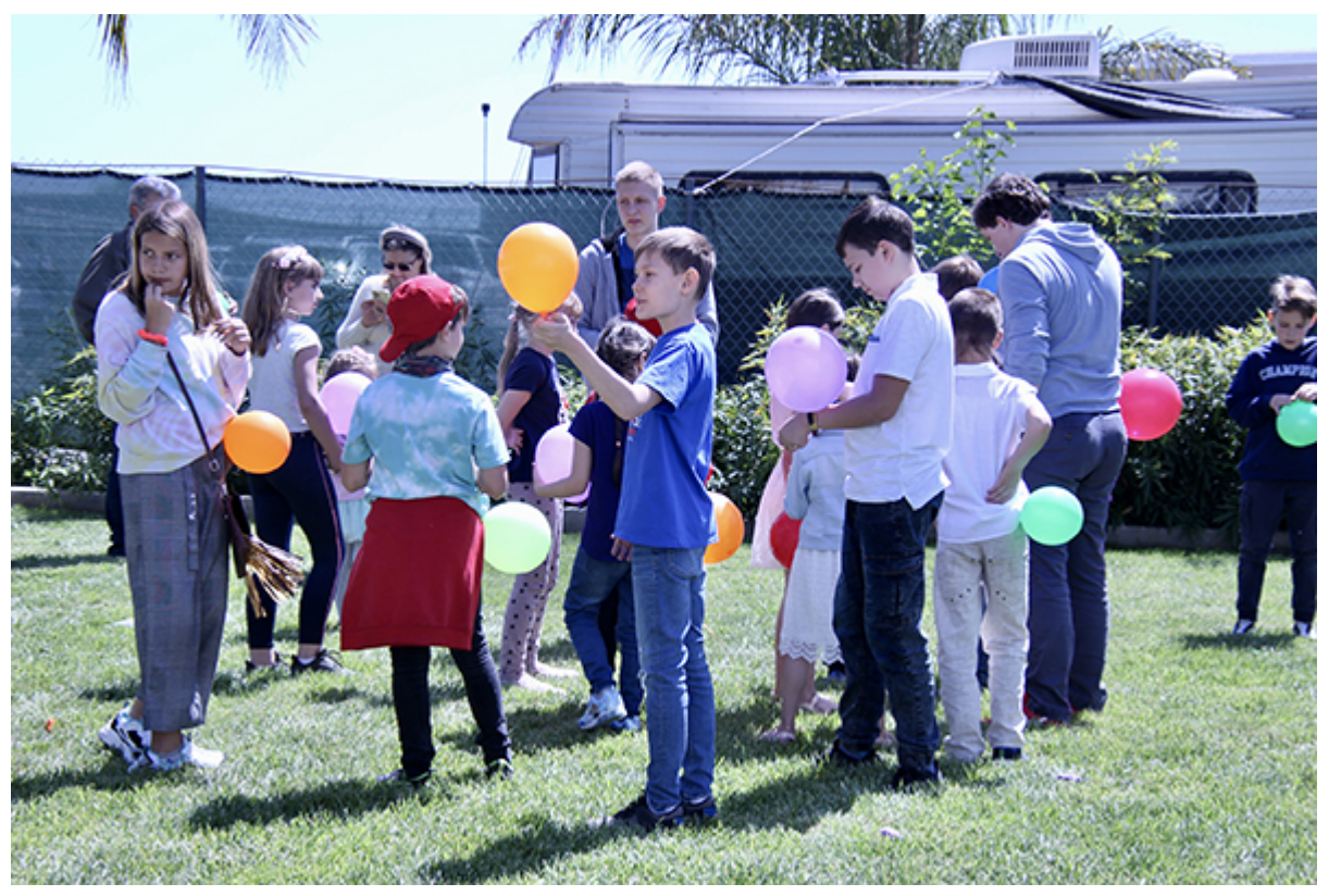
The Children Had Their Own Activities During the Celebration/em>