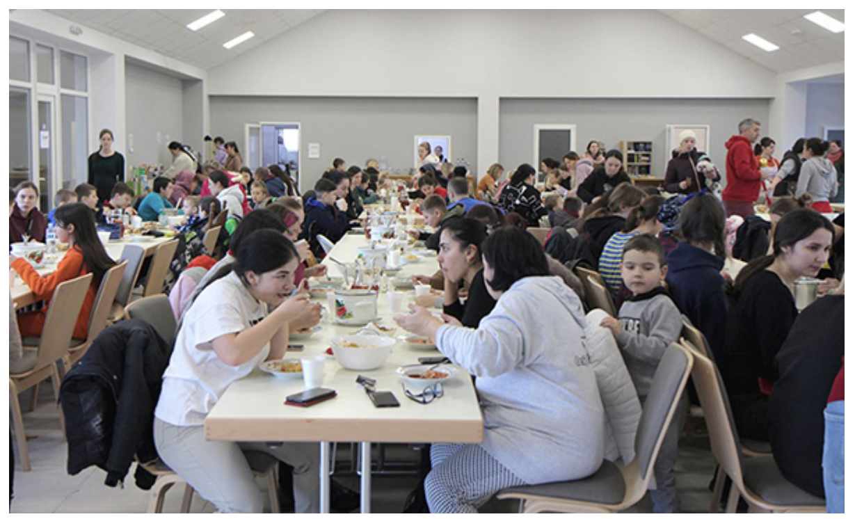
Dining Room of the Relief Center Where Refugees Are Served Hot Food Three Times a Day