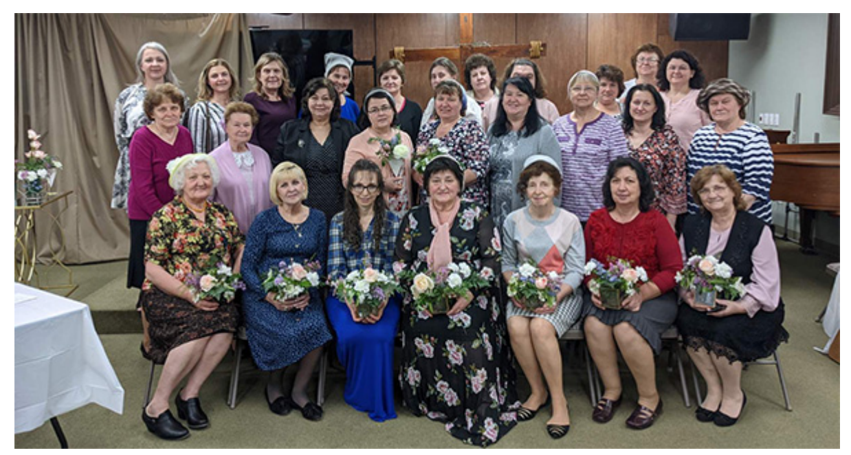
Prayer Breakfast Participants