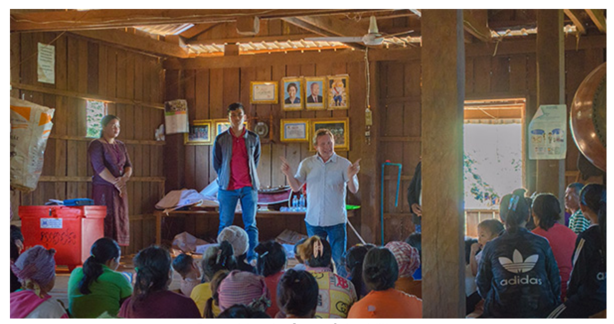
Preaching in One of the Villages