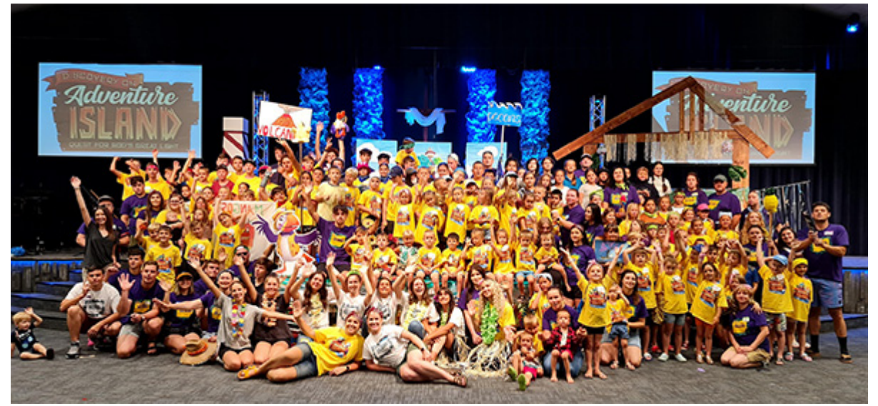
Here it is! The growing generation of the church! May the Lord guard them for His kingdom!

An annual children's summer camp took place at Grace Avenue Bible Church at the beginning of July. The territory of the church turned into a real adventure island, where young explorers had to find a way to the source of spiritual light, as well as learn how to reflect this light in their lives. One hundred and twenty children, and sixty volunteers were involved in the program. More information can be found on the Association's website (in Russian only.)