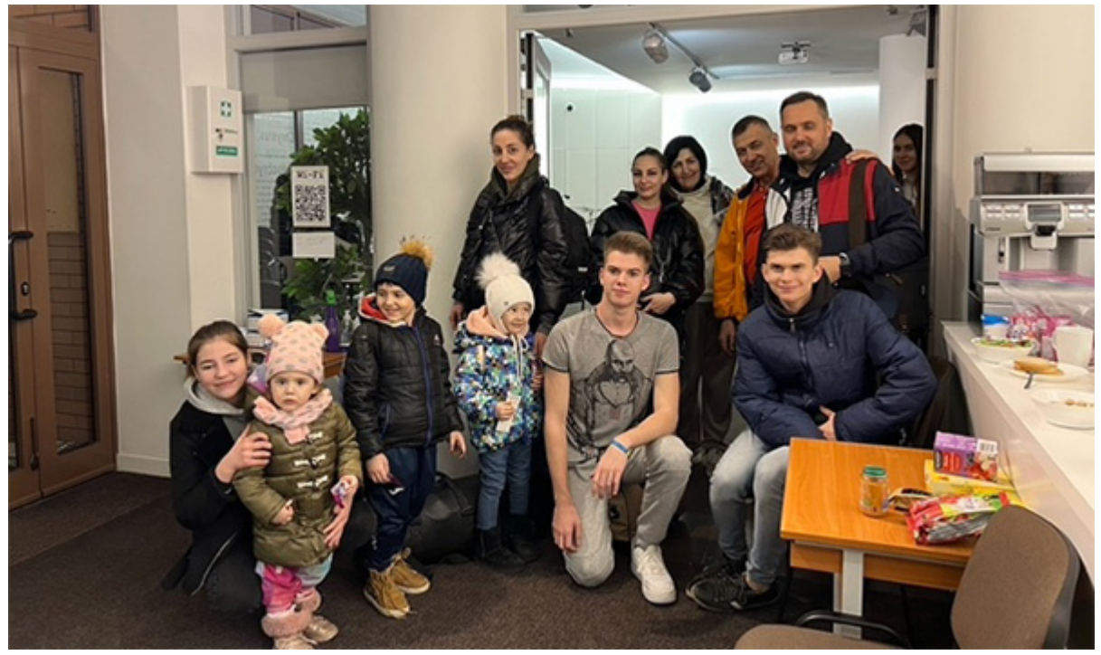
One of many meetings with refugees