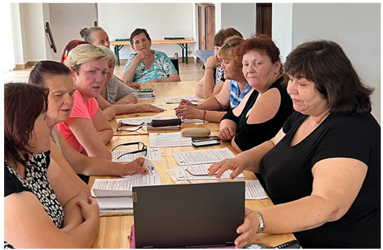
Bible study with the refugees