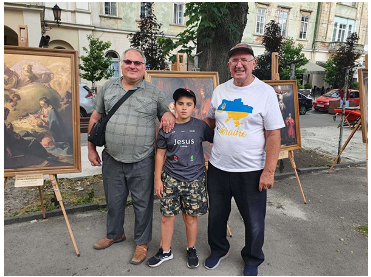
During the time of street evangelism through Christian art