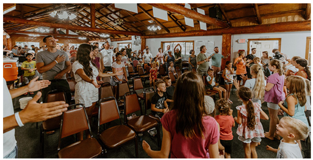
At the time of service

Three hundred and fifty-five people attended Tacoma Good News Church's family camp. The event took place at the end of July and set two goals for the participants: to grow in relationship with Christ, and to improve relationships with church members. Based on the commandments of love for God and neighbor, the general theme of the camp was: "The Church that God Desires." <u>Details can be found on the Association's website (in Russian only.)</u>