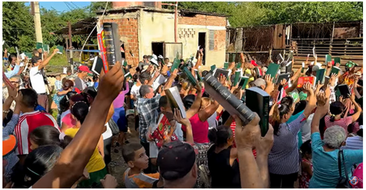
As a sign of gratitude, the people are raising the newly-received Bibles