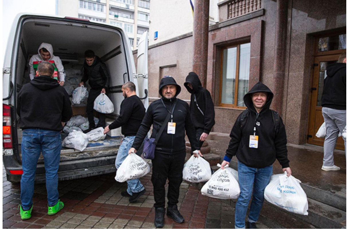
Gifts for the Refugees