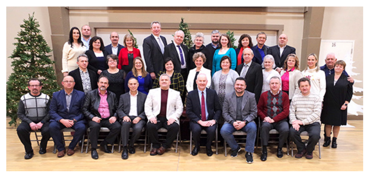
Members of the Committee and department leaders with their spouses