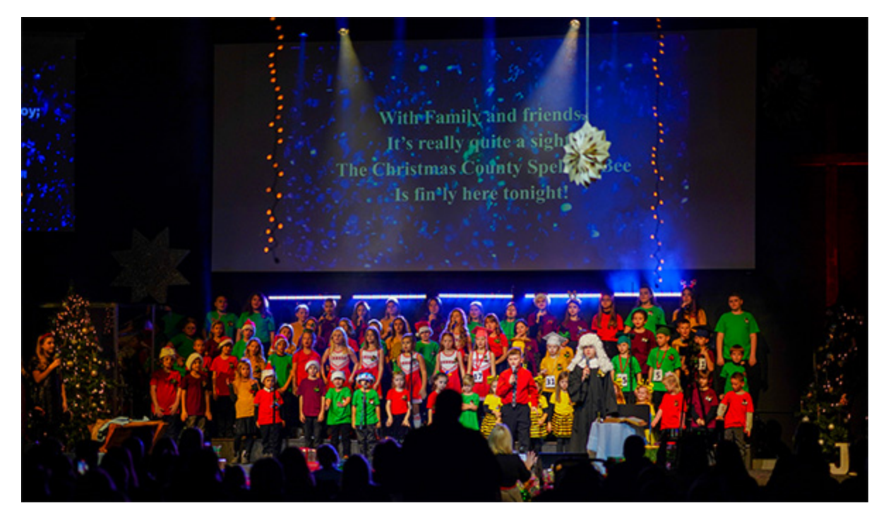
CHRISTMAS CELEBRATION AT THE LIVING STONES CHURCH