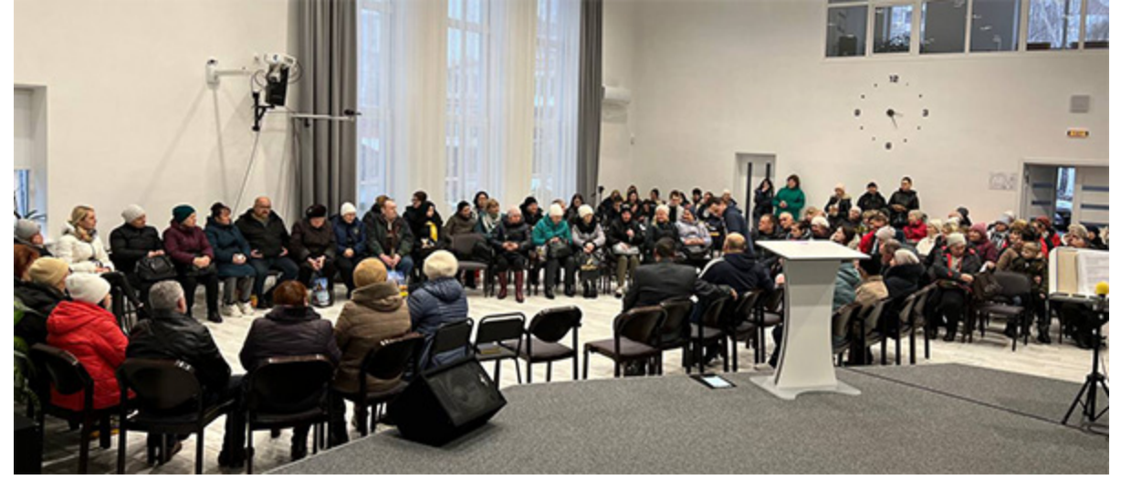
One of many meetings...