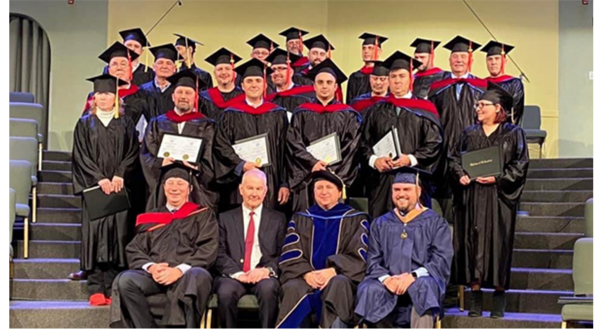
Graduates and instructors