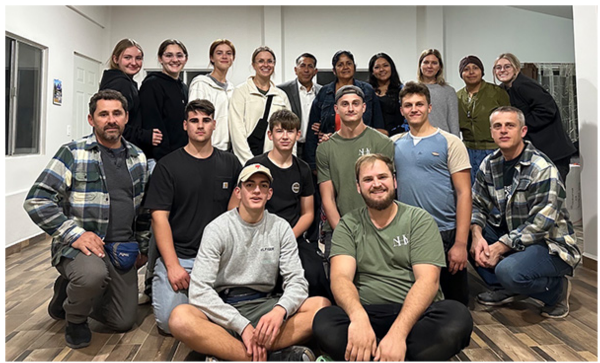
The team of missionaries with local brothers and sisters