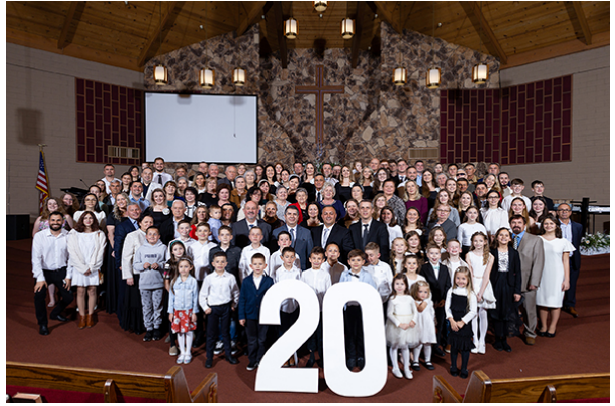
New Hope Church