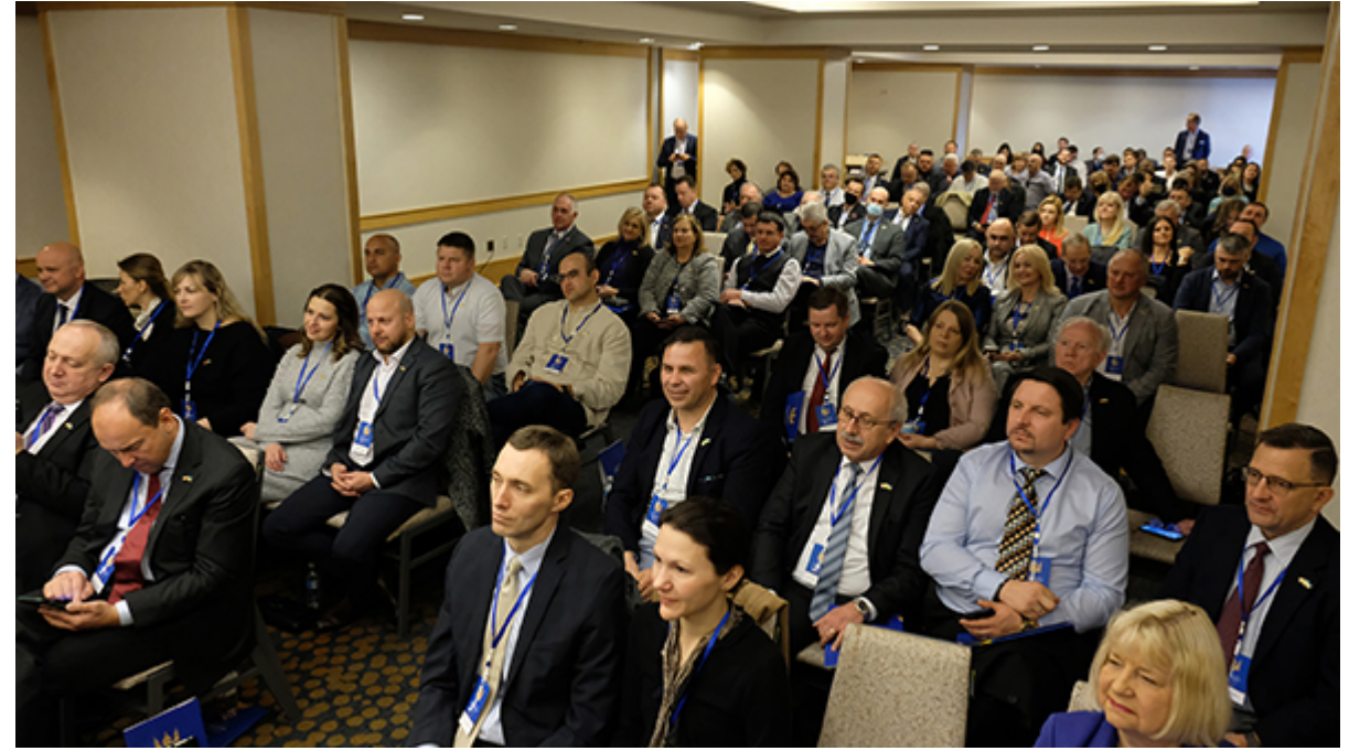
Prayer Meeting Participants