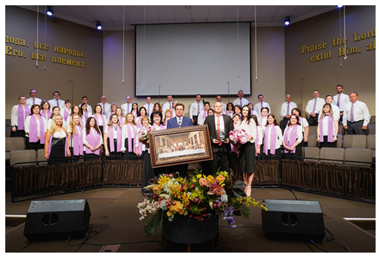
Both pastors and their wives