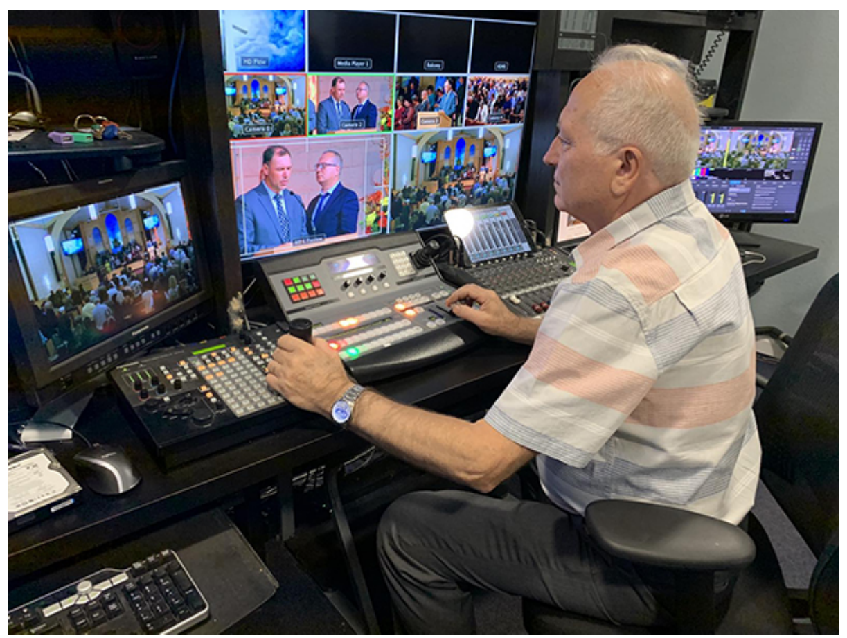
Ministry in action...