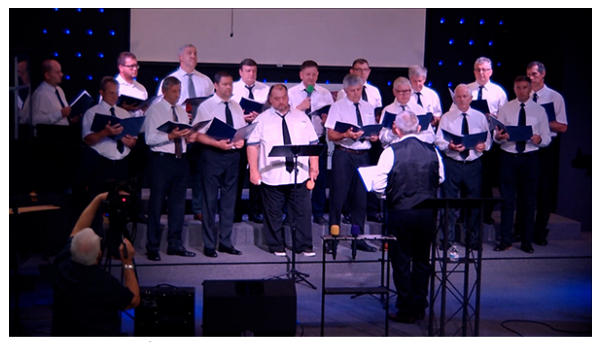
Choir's participation during the church service