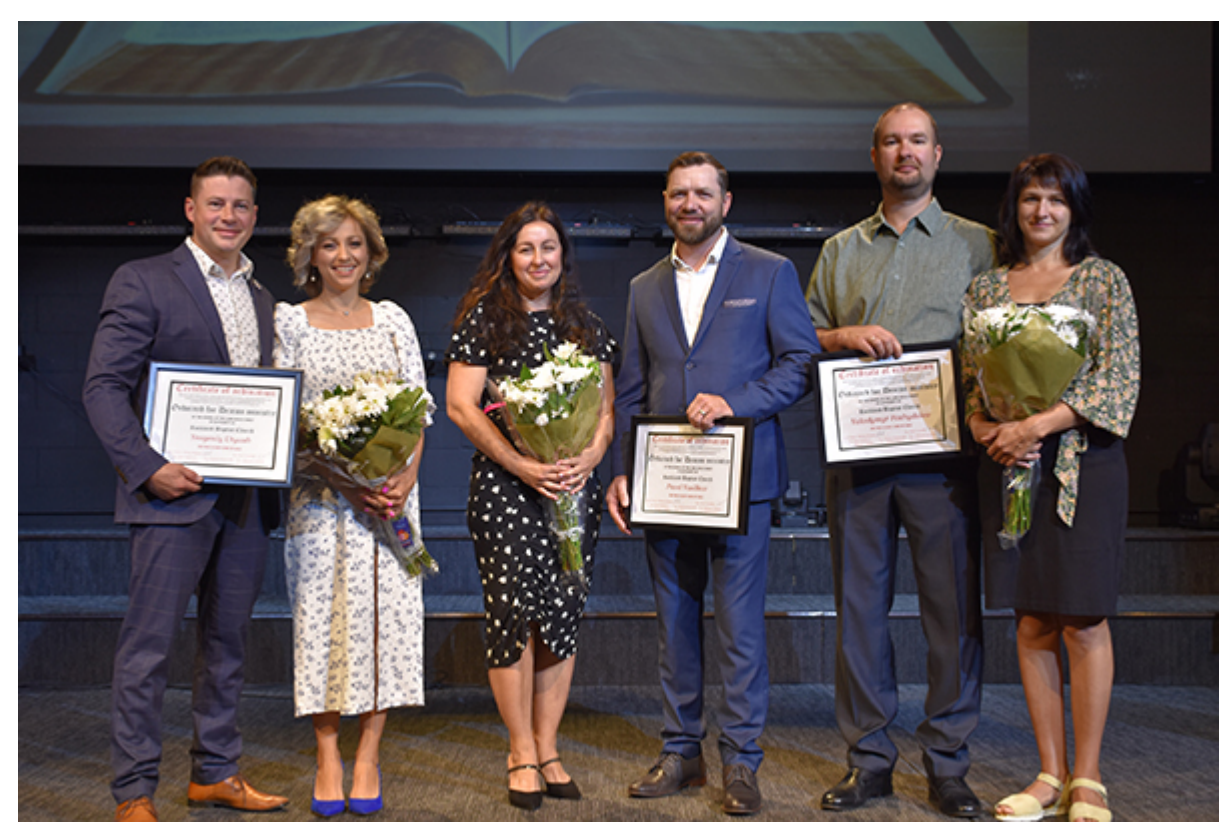
New deacons and their wives