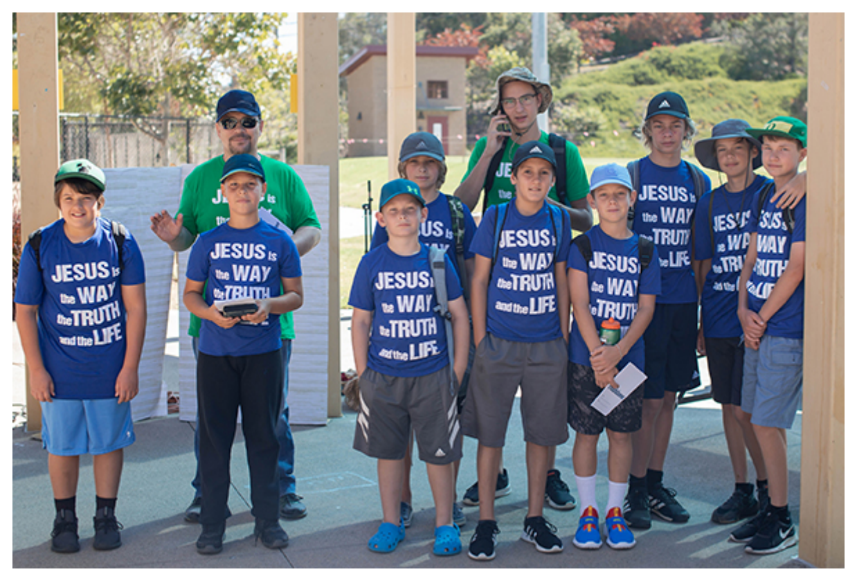
May the Lord bless them so that they all would be Christians!