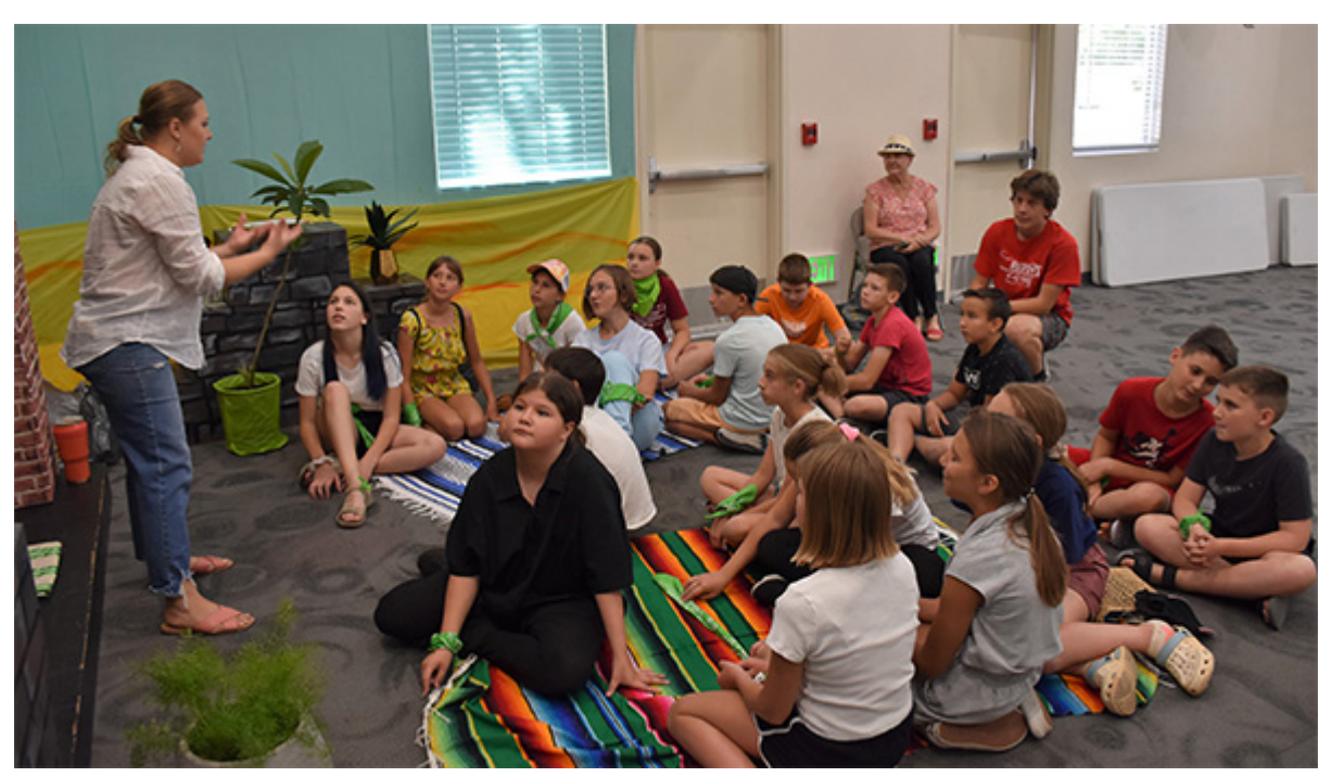
Lesson time in one of the groups

Week-long VBS (Vacation Bible School) has become popular at the Slavic churches during the summer break, and are sometimes also called children's camps. RockLand church also held one of these camps, where they had a great balance of Bible teaching, entertainment, and mutual fellowship of children. Read more about it here (in Russian only.)