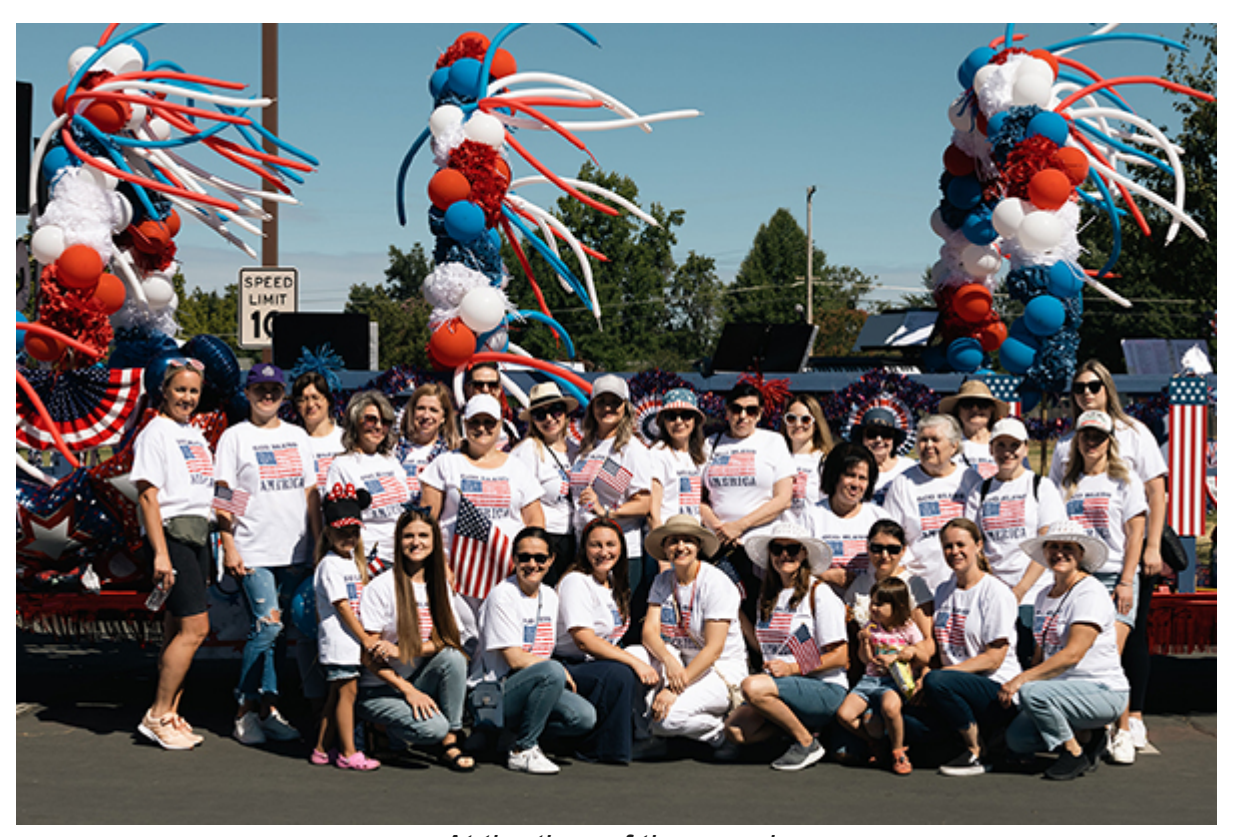
At the time of the parade