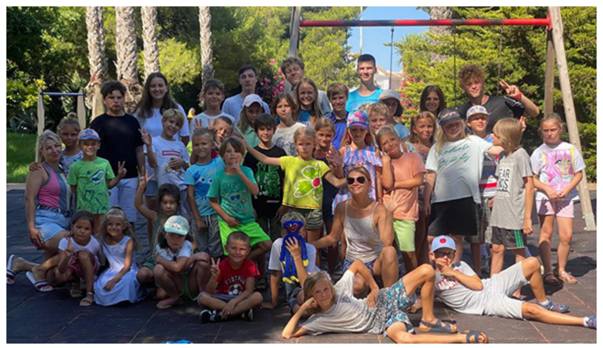
A moment of joy and fun after the horrors of fleeing their home country