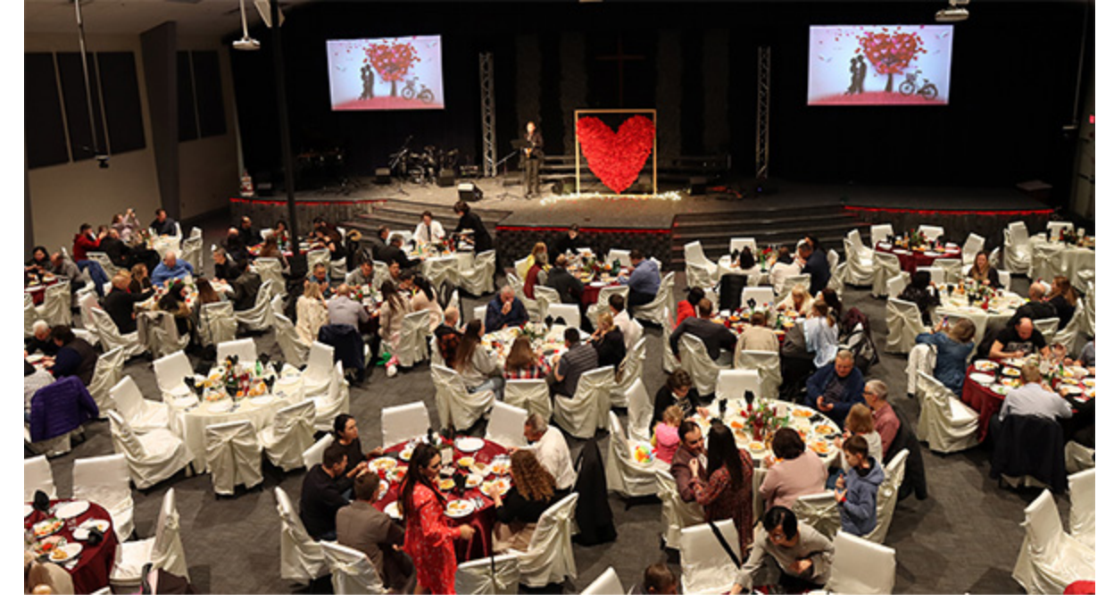
Everything Looked Very Festive!