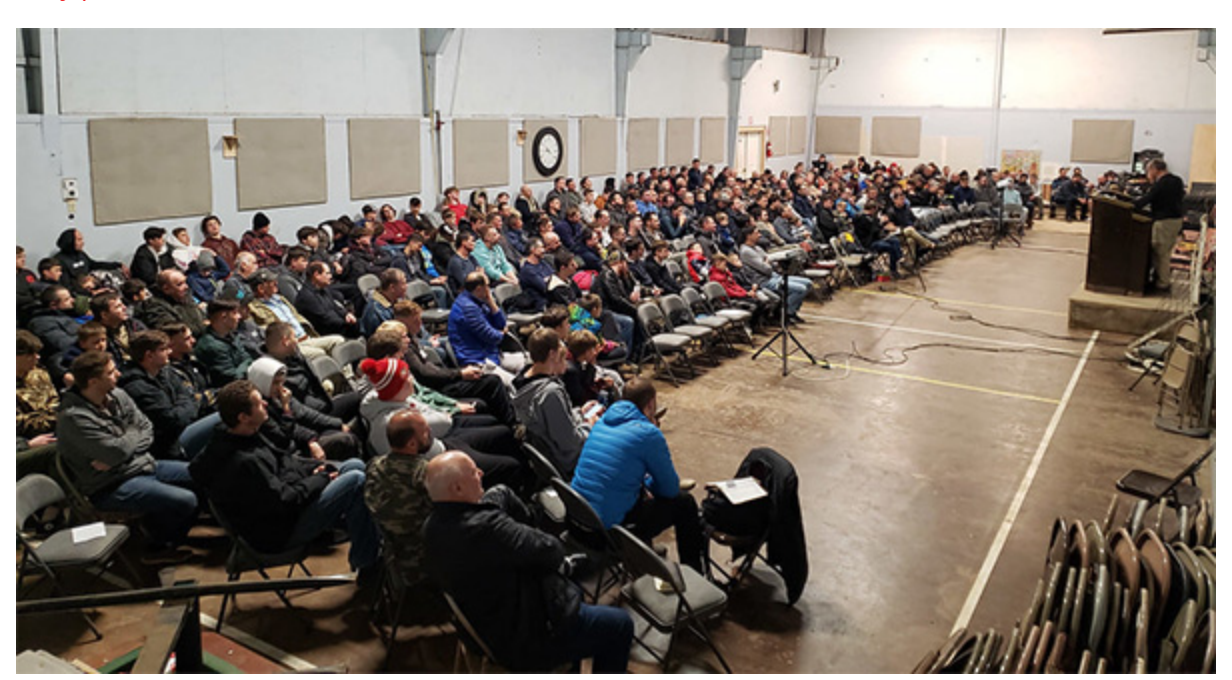
Men's Retreat is Becoming More Popular Every Year!

On February 18-20, Russian Baptist Church of Bryte organized a retreat for the fathers and sons at the place not too far from Sacramento. The retreat took place in an informal setting, with unified prayer, beautiful nature, campfire food, extreme sports and off-roading which helped to offer some quality time and strengthen the relationship of at least three generations. The youngest camp participant was 5 years old, while the oldest was 70 with the total number of people being 320 people. For more information, read on the Association's website – click this link (In Russian only.)