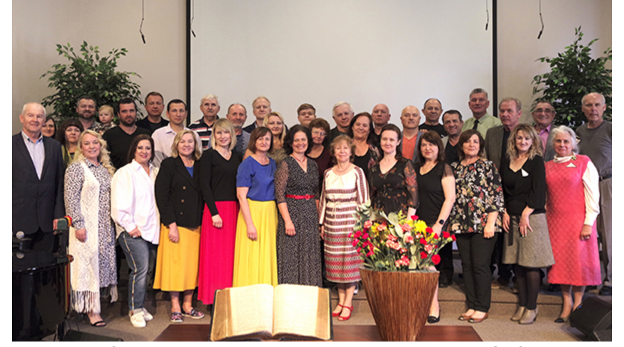
Participants of the Pastors' and Women's Meetings in the southern California