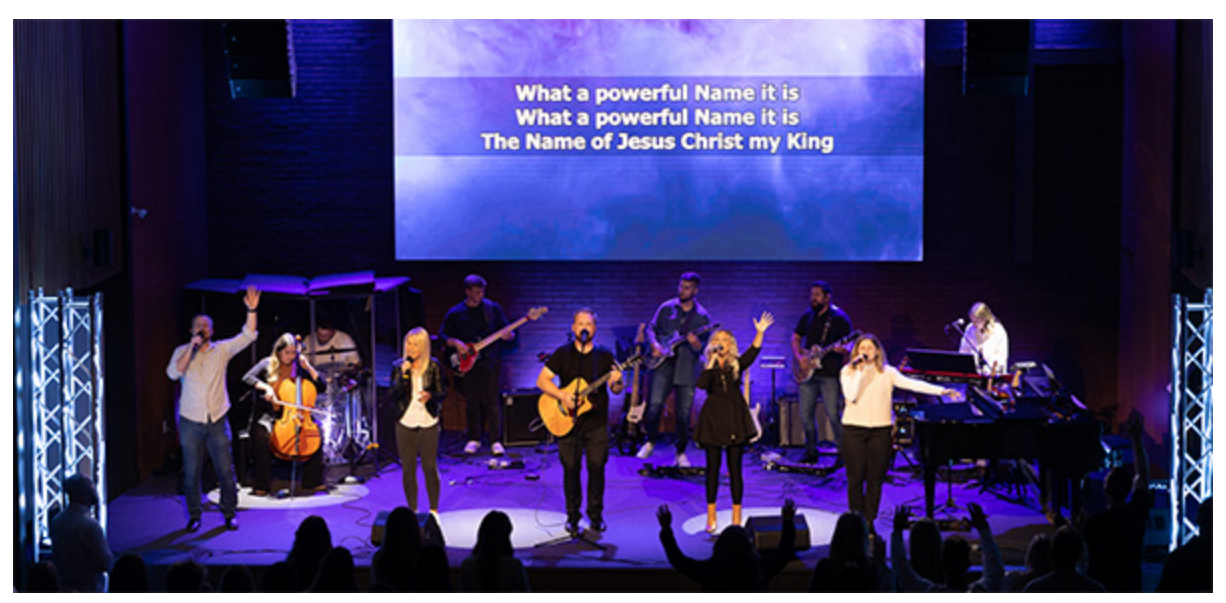
Youth during worship