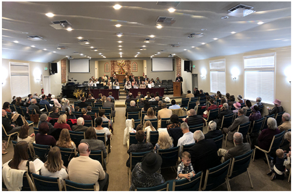
During the celebration service

was attended by over a hundred people. For more information about the celebration, <u>read an article by N. Yurkova (in Russian only.)</u>