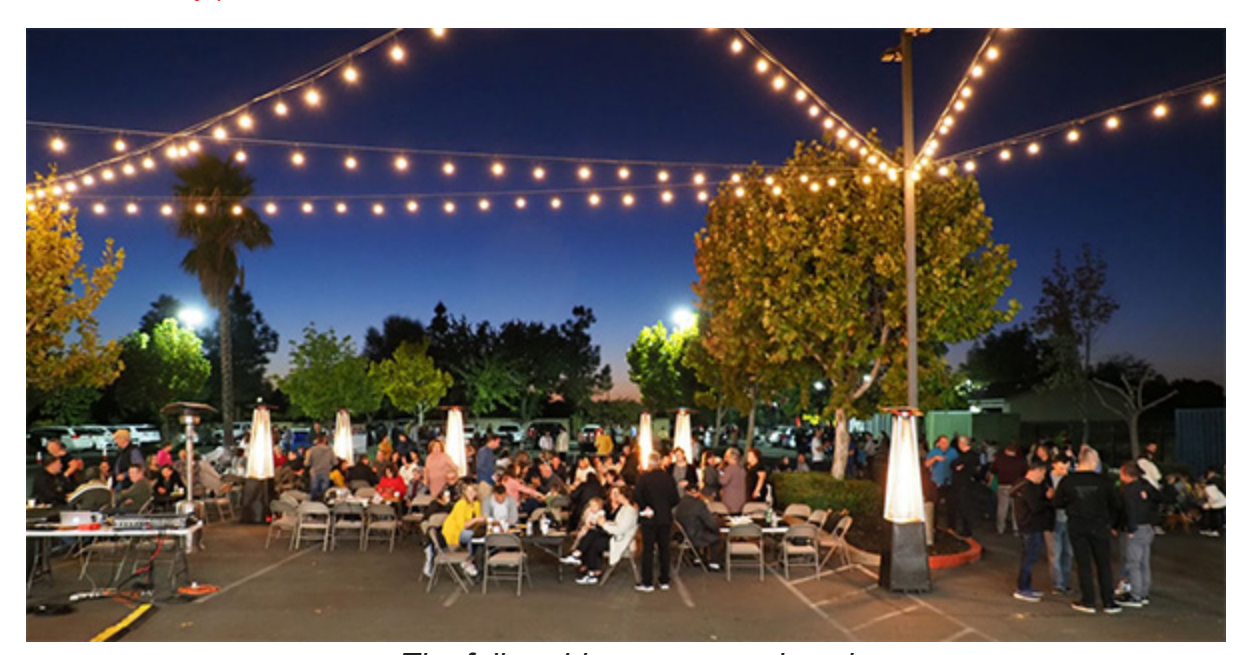
The fellowship was very relaxed