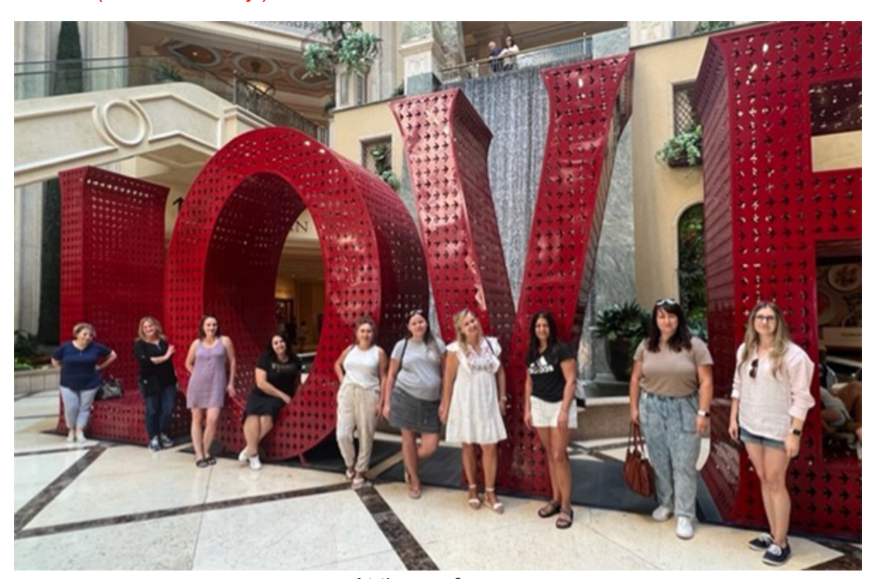
At the conference