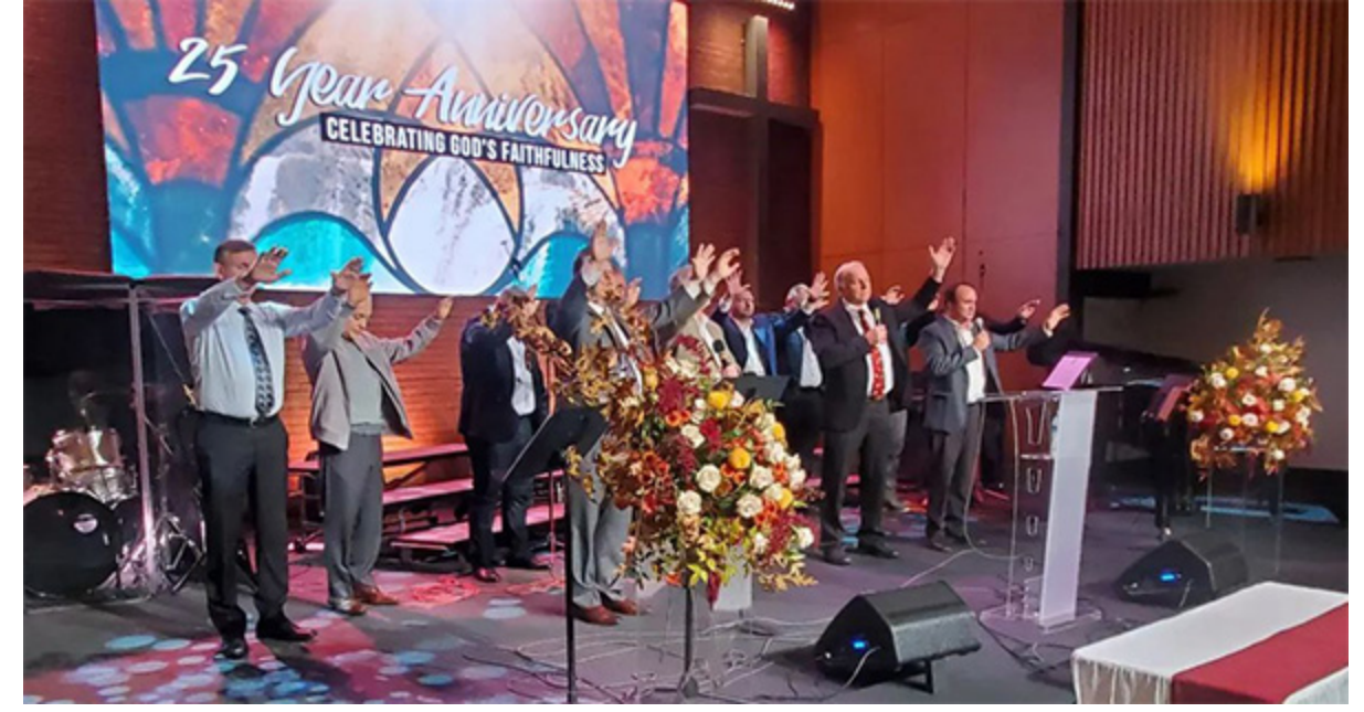
Pastors' prayer for the church