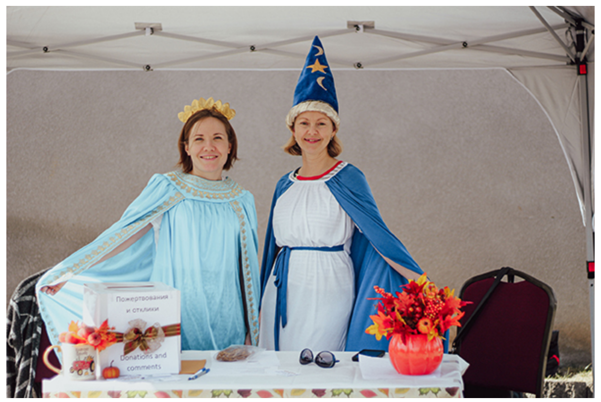
One of the festival's stations