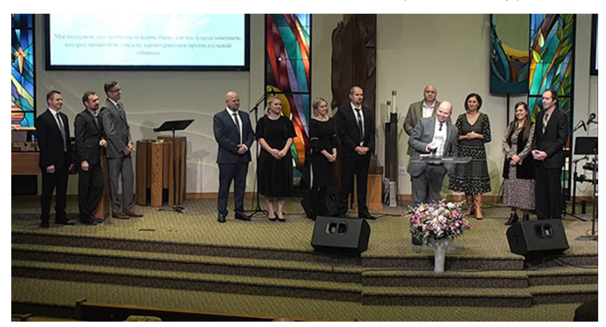
New church deacons and their wives