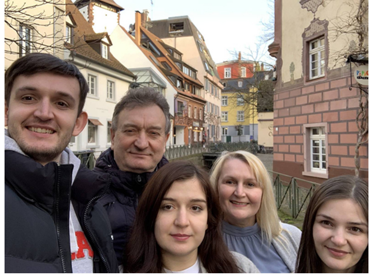
The missionary's family