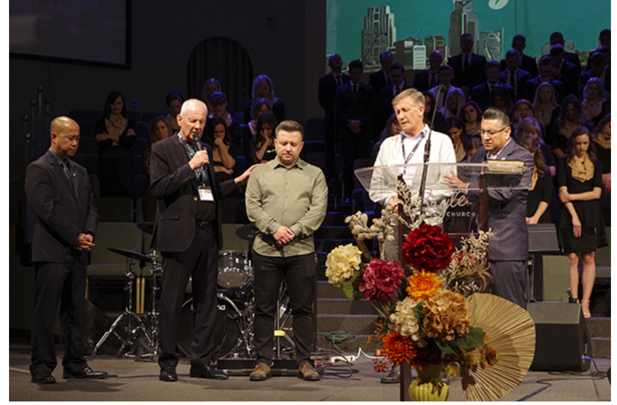
Prayer for peace in Ukraine