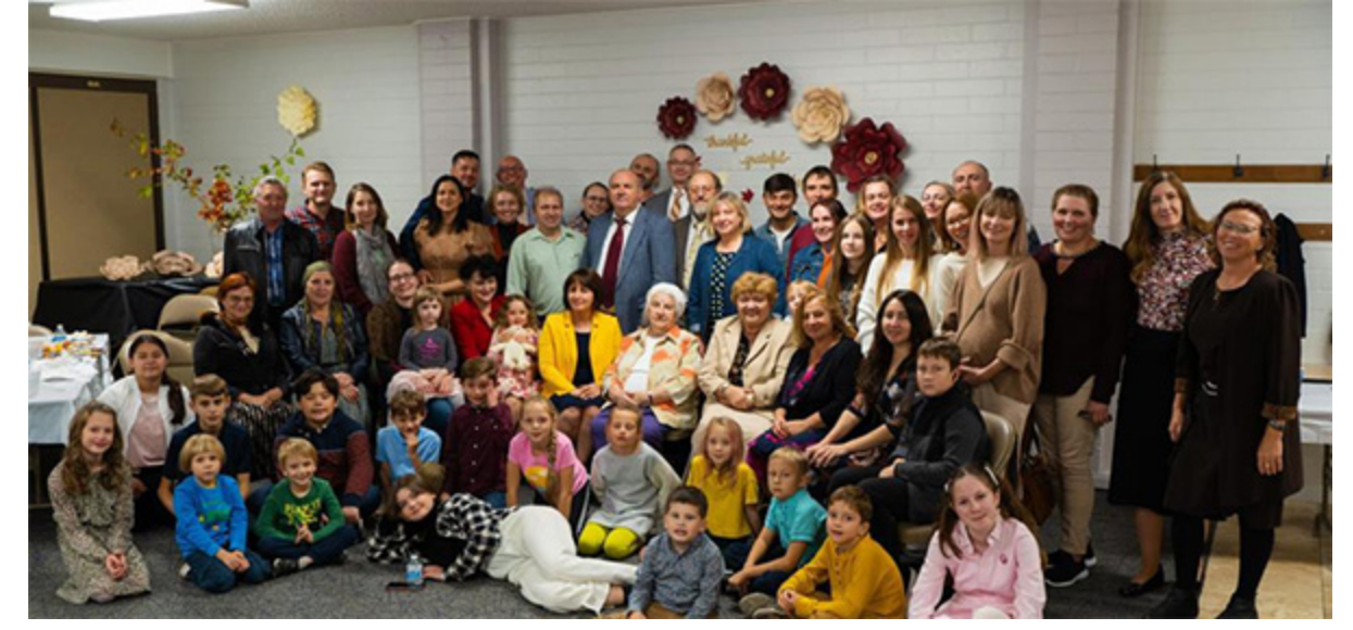
Group picture after the Harvest celebration