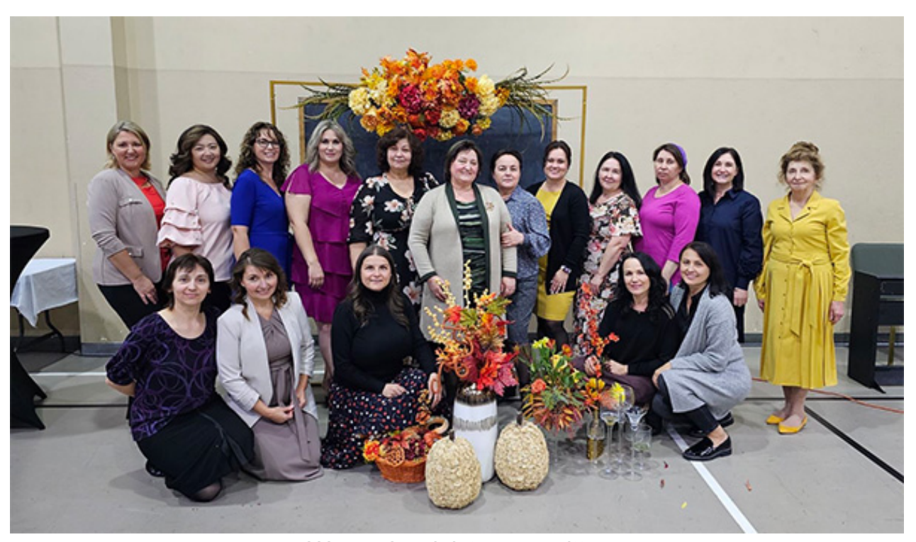
Women's ministry committee