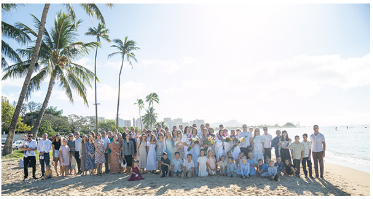
Baptism is a celebration for the entire church

On Sunday, December 3, 2023, Slavic Church of Honolulu had a baptism service. Four new members were added to the church. This event was a cause for much celebration for the church family, especially for those who dedicated their lives to Jesus Christ. More details... (in Russian only).