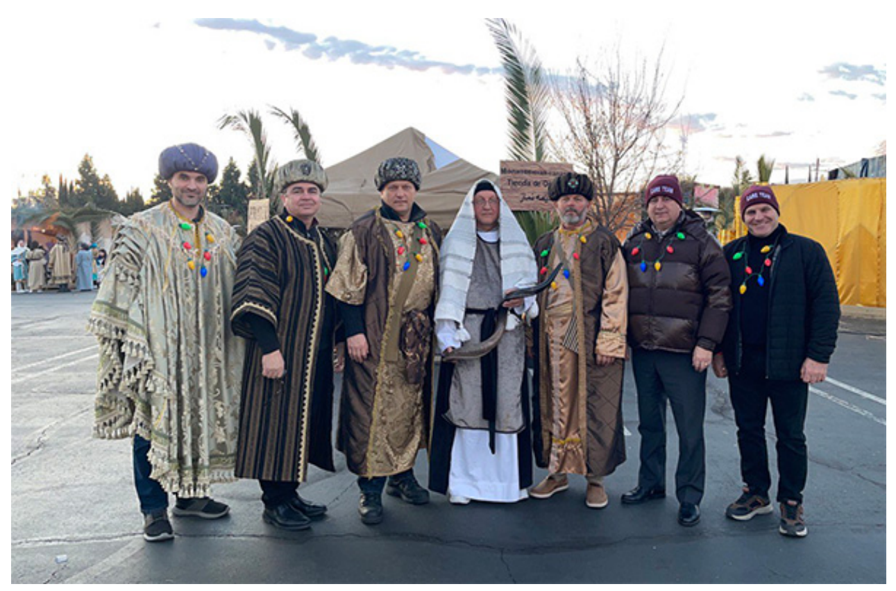
High Priests, priests, prophets, and other pastors at the Bethlehem Village