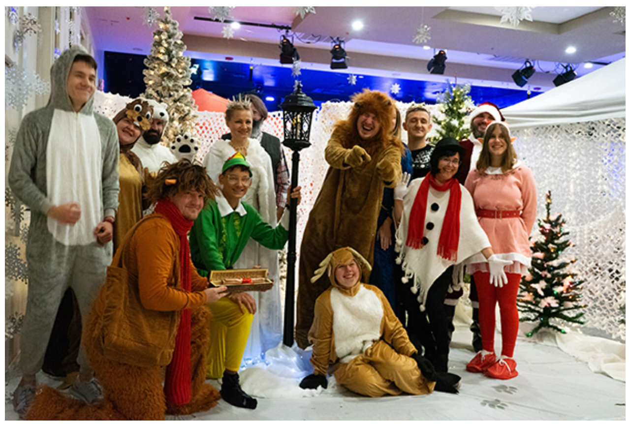
Characters of an epic adventure