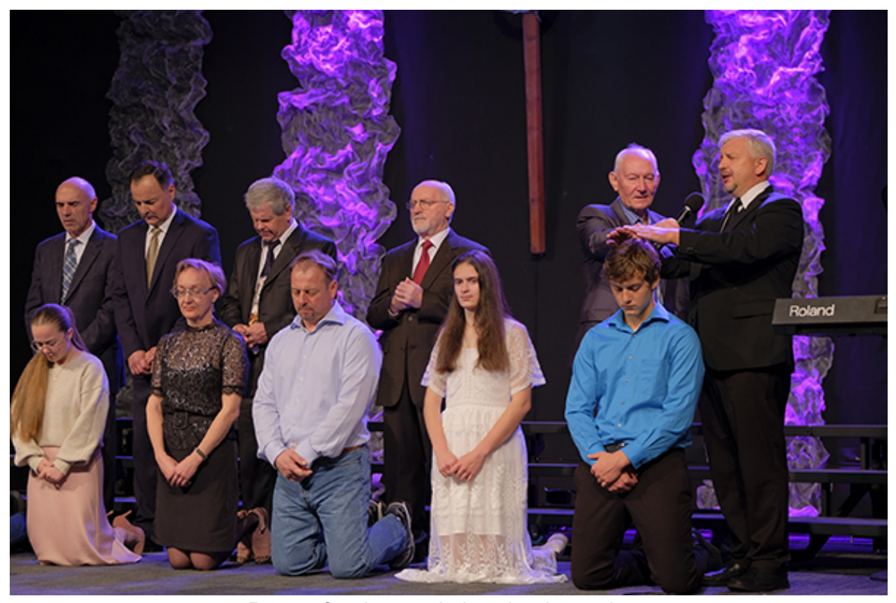
Prayer for the newly baptized members