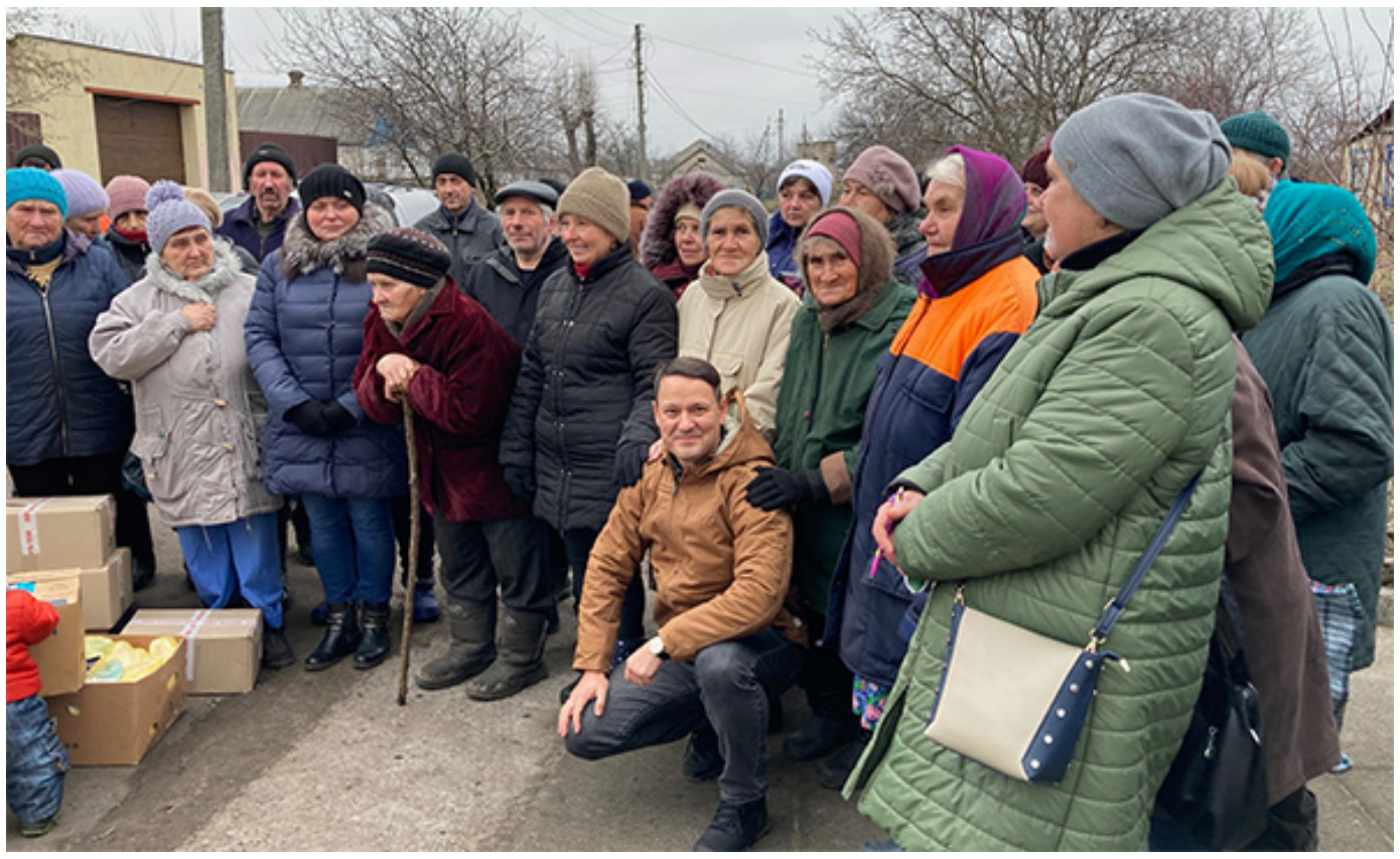
Distribution of humanitarian aid to local residents