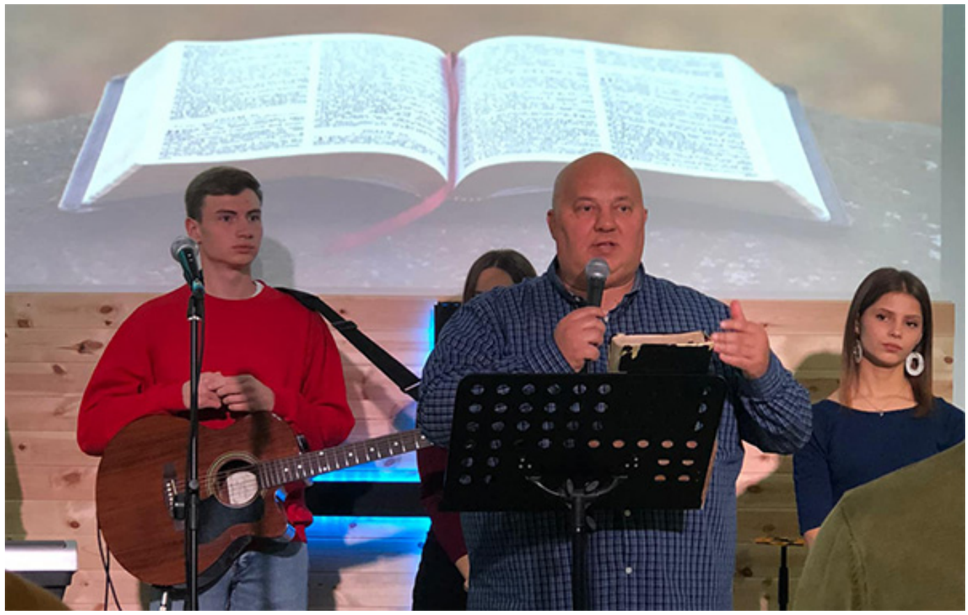
While serving in the church of Tarrivieja, Spain