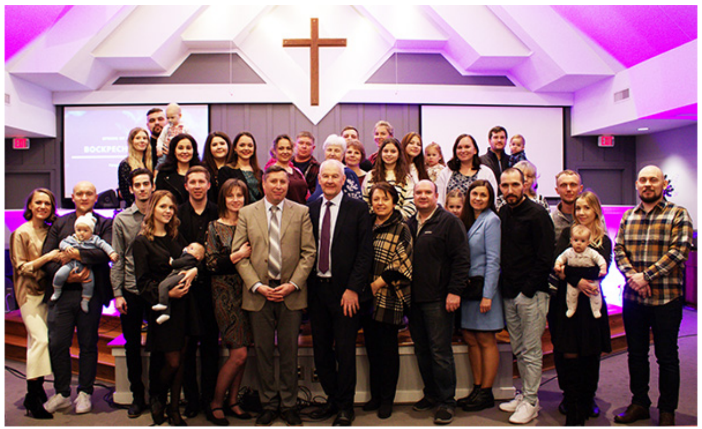
Happy birthday, Spring of Life Church!