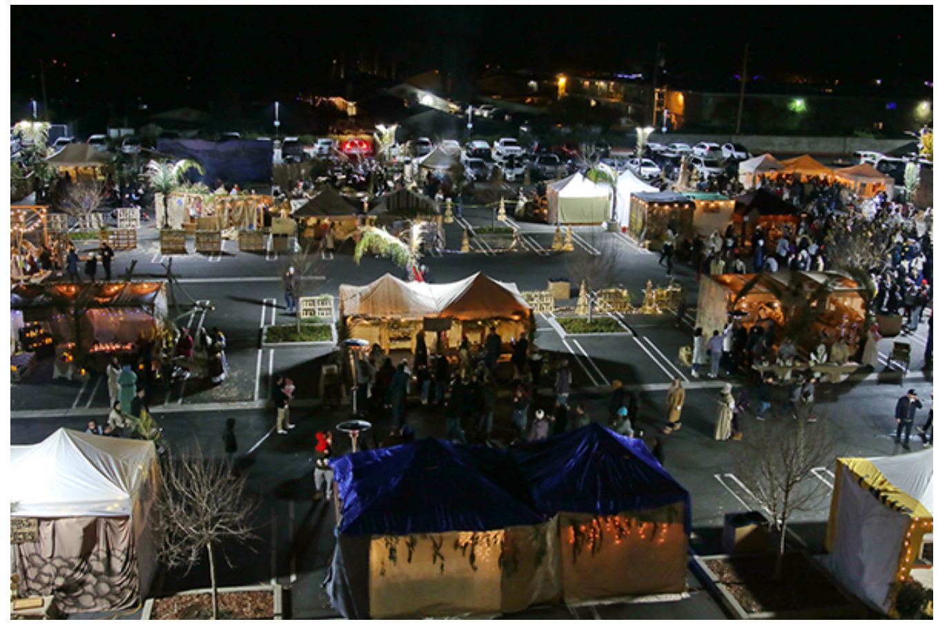
The Bethlehem village...