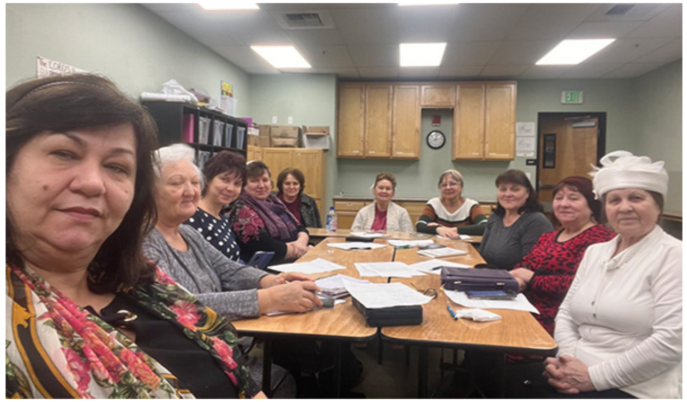
Meeting of the women's committee