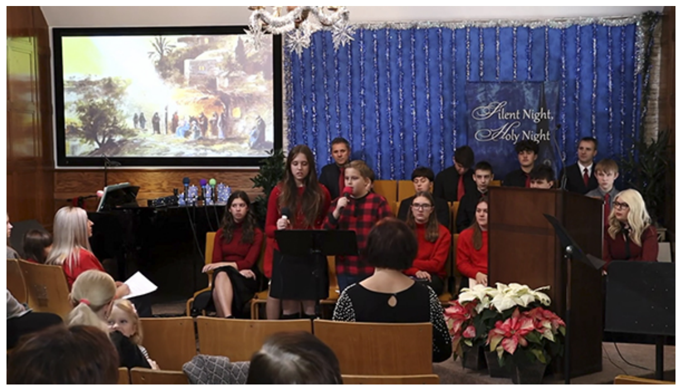
Scene from the play

On January 8, guests from First Slavic Baptist Church in Sacramento visited Fist Slavic Baptist Church "House of the Gospel" in San Francisco. The Christmas greetings and blessings, choir singing, and children's program, as well as the preaching of the Word and prayer, encouraged brothers and sisters of the small church in San Francisco. Details can be read in an article by O. Chanova (in Russian only.)