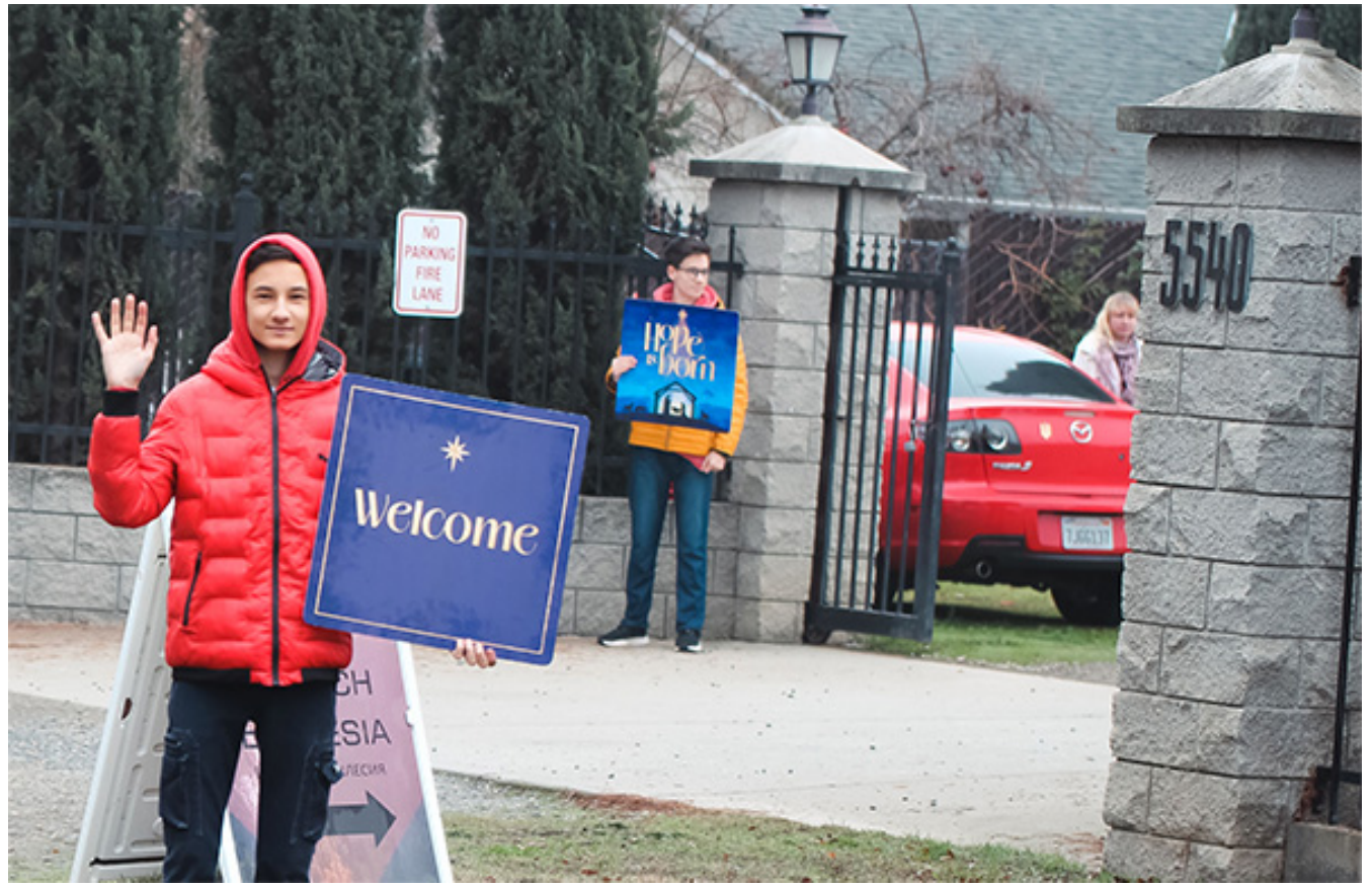
Welcome to the new church building!

The church service was evangelistic. For more information, <u>read an article by S. lotko –</u> <u>click this link (in Russian only.)</u>