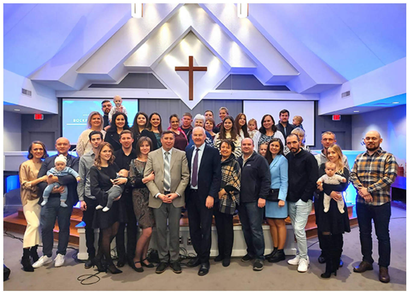
Spring of Life Bible Church after their first service, Greenville, South Carolina

We welcome these churches in our Association, wish them blessings from the Lord, and hope for successful cooperation with them in serving to God.