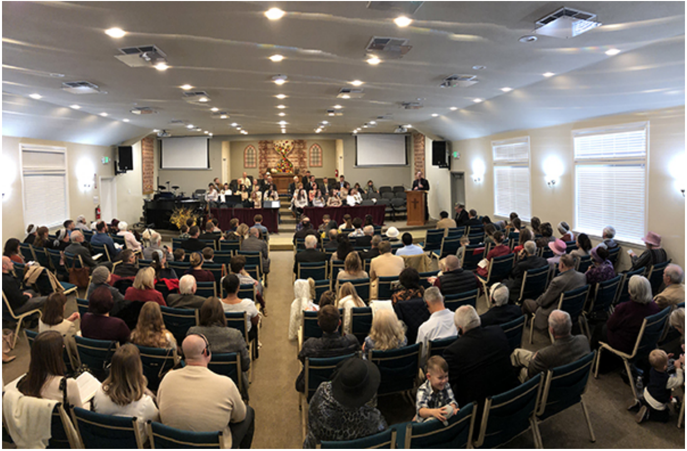
Mission Boulevard Baptist Church today...