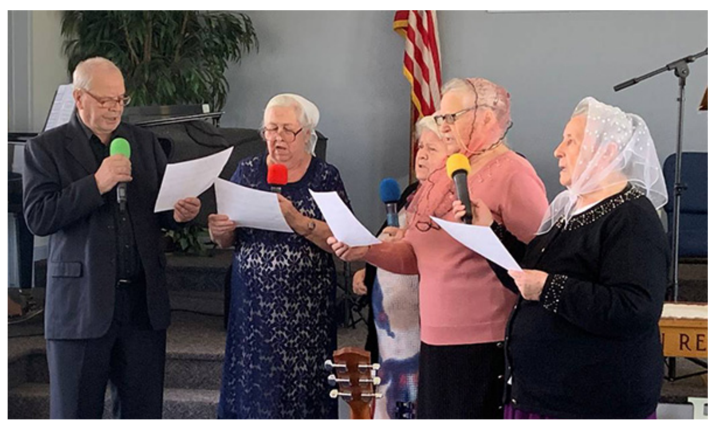
Guests from Altamedix singing