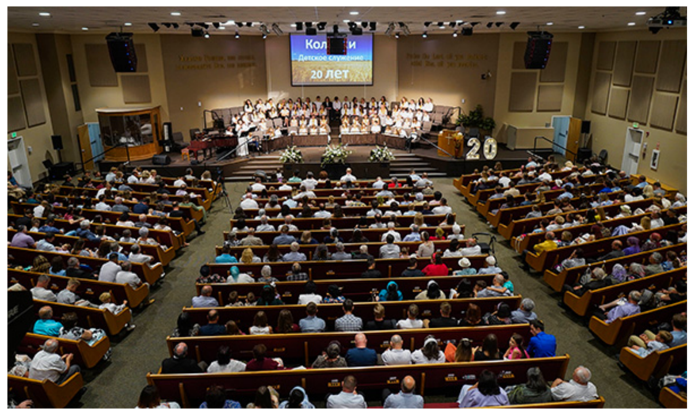
Celebrating the anniversary

During these 20 years, the choir participants were able to perform in numerous events of various themes, women's ministries, prayer breakfasts, widows' meetings, as well as church services for children with special needs. More information can be found here (in Russian only.)