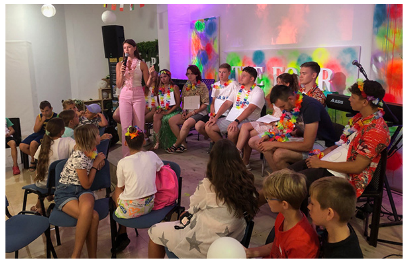
Bible lessons during the camp