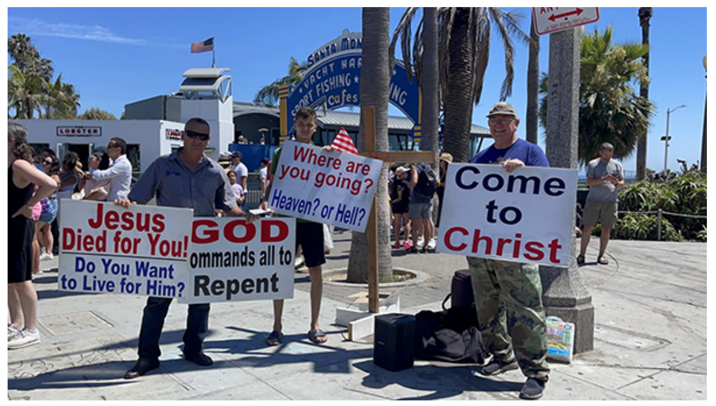
On the beach in Santa Monica