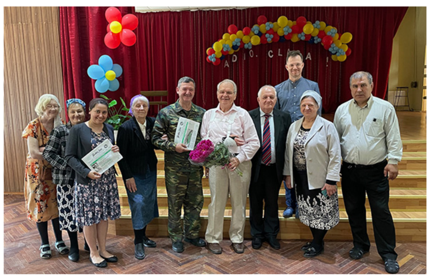
One of the meetings in Moldova