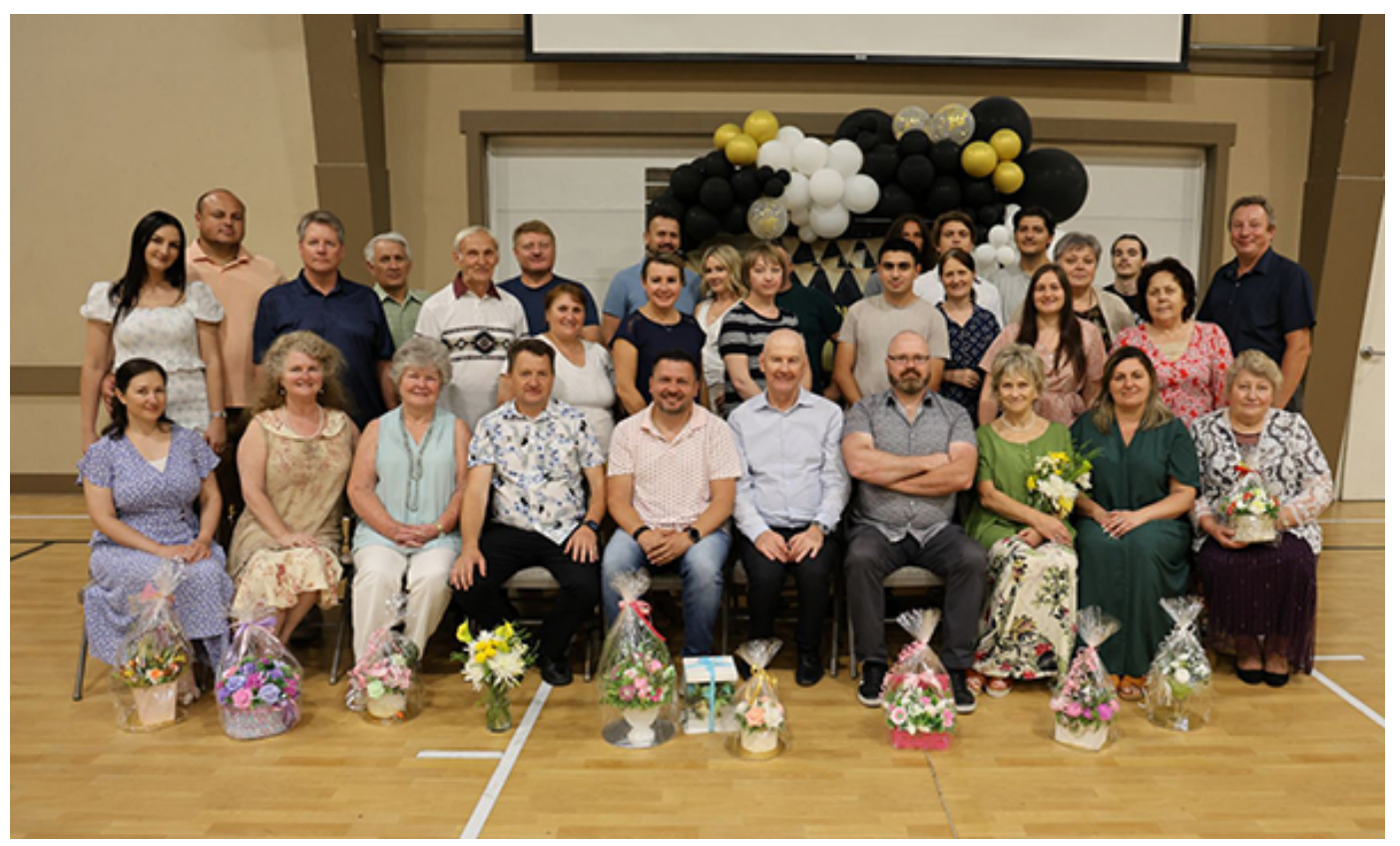
Staff and volunteers of the store