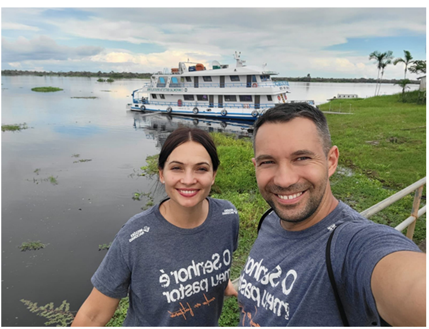
On the Amazon River