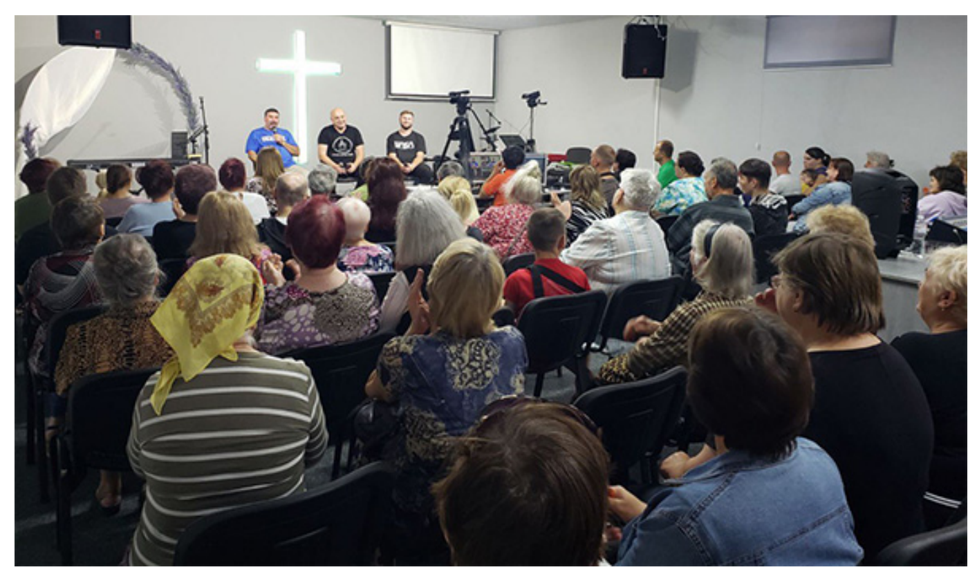
During one of the meetings in Ukraine