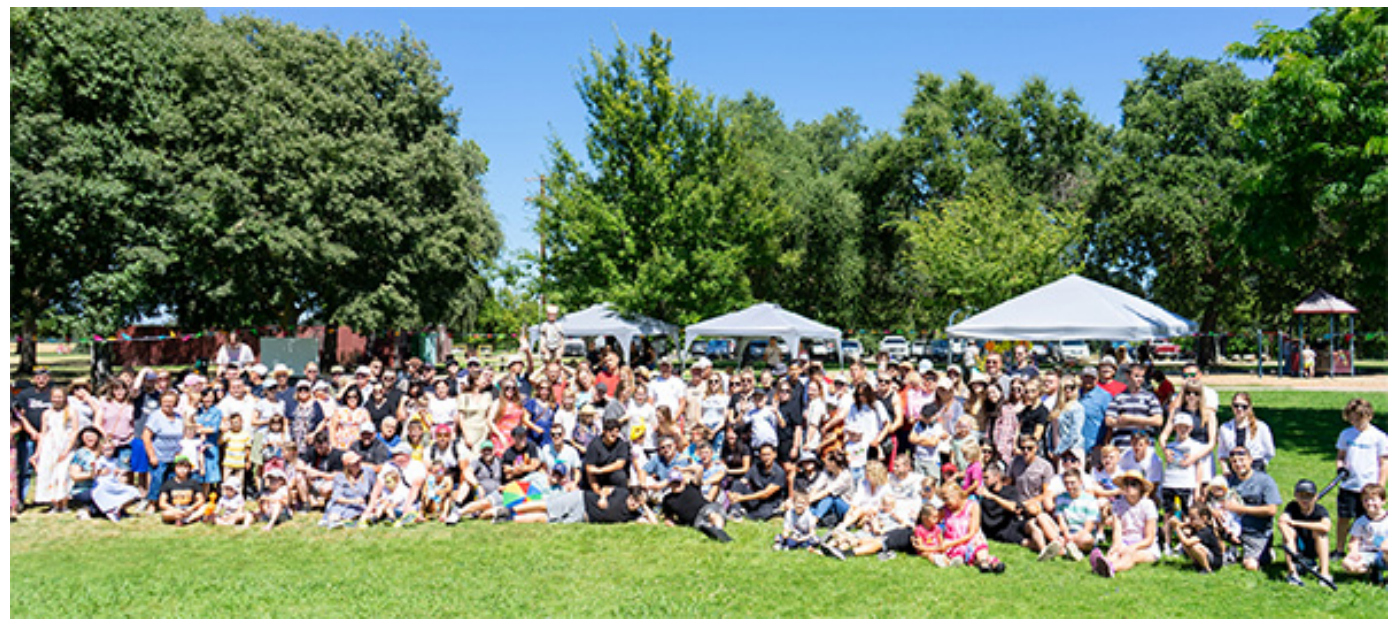
At the picnic

On July 9, after the morning service, the Cornerstone Church had a special picnic for immigrants. Over 350 people were able to attend, and it was a great success! Many immigrants came to church for the first time, and some of them were very surprised how they were able to feel the warmth and be so comfortable in the company of Christians. More can be found here.