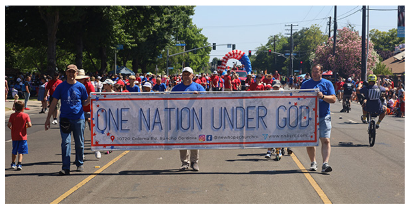
Church Involvement in the Parade