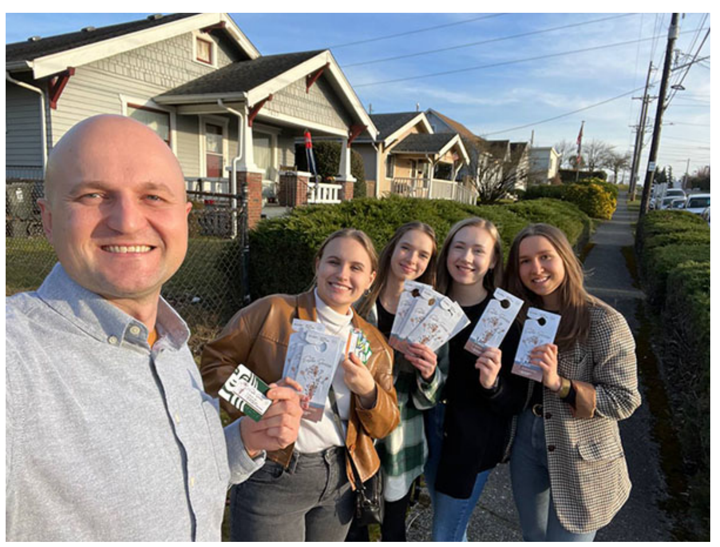
During street evangelism