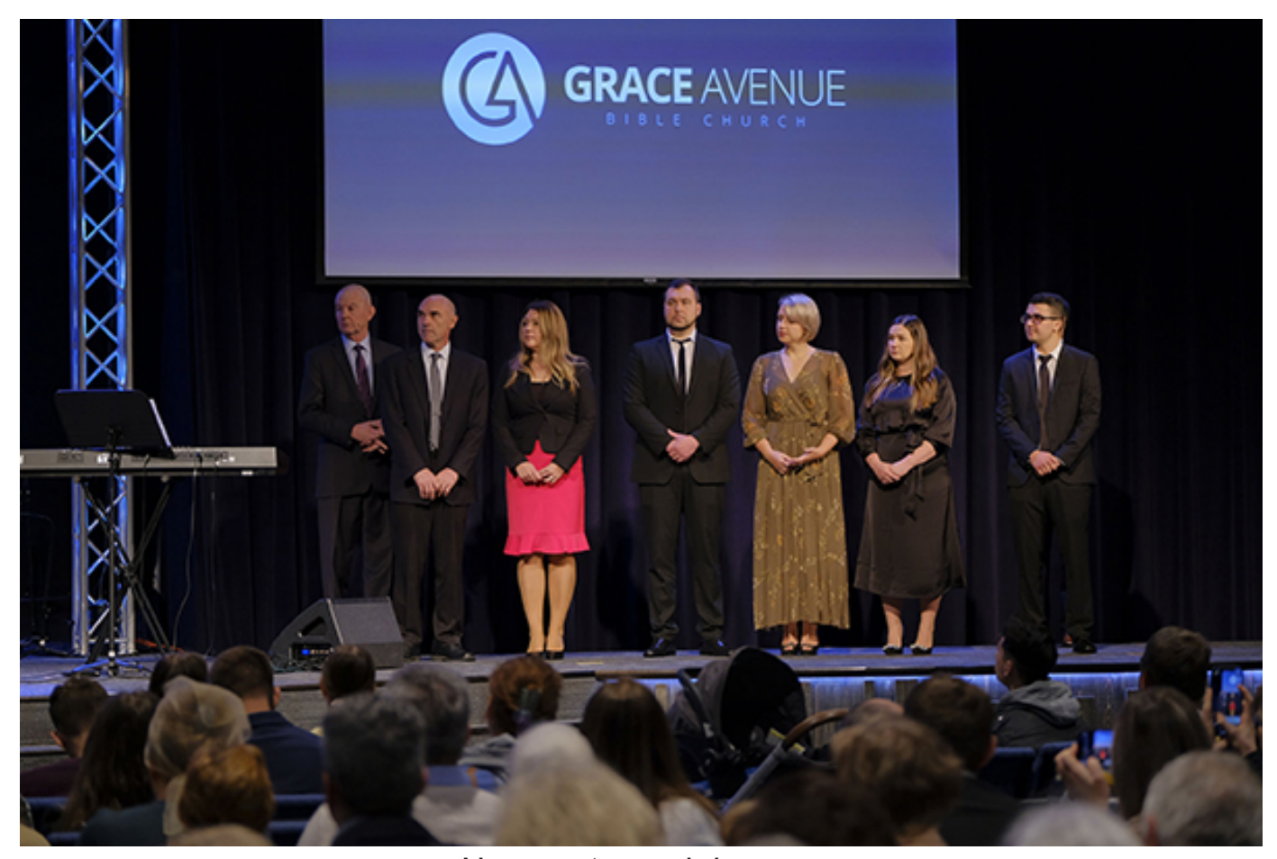
New pastor and deacons