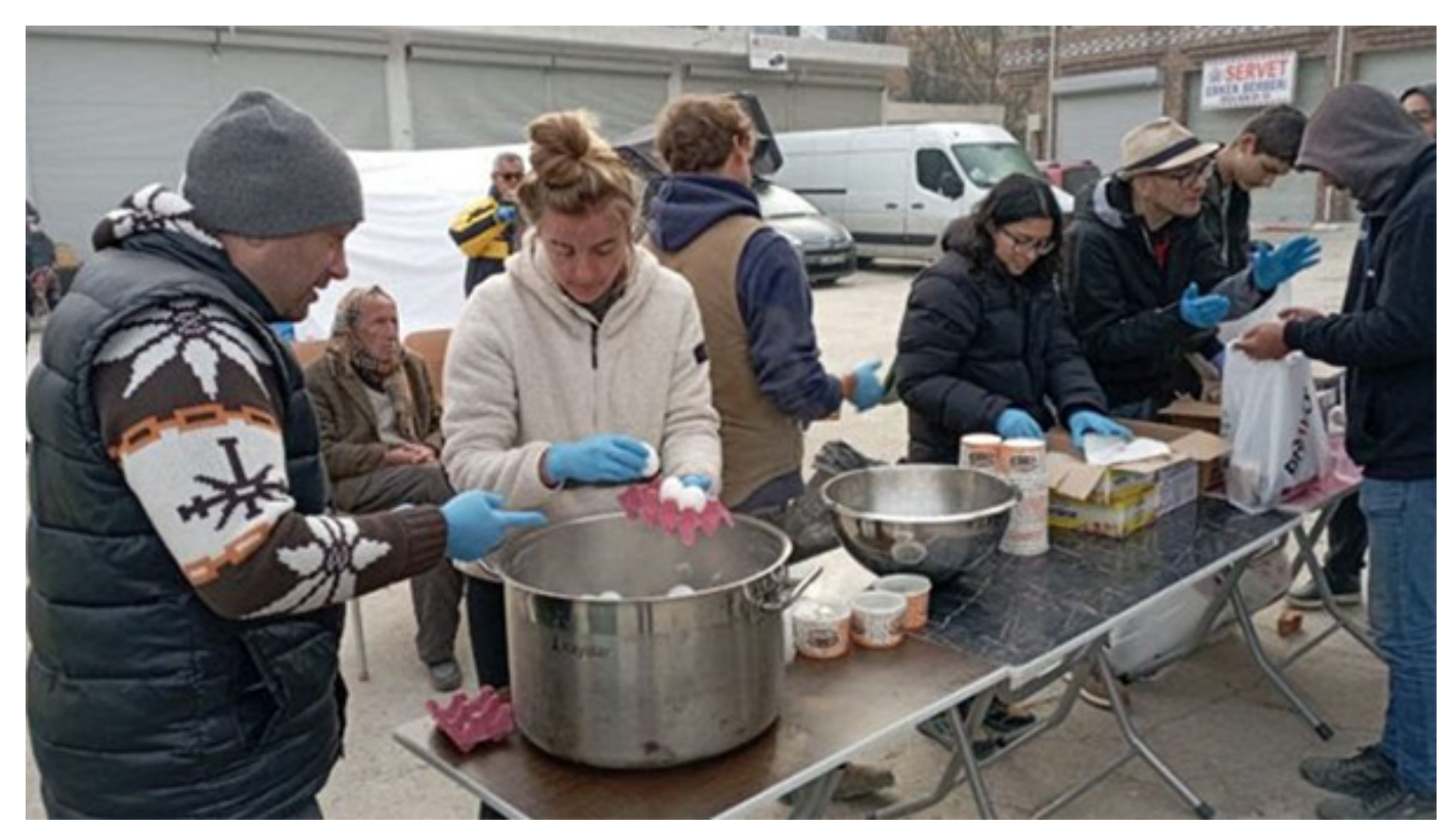
Feeding sometimes up to 800-1,000 people per day