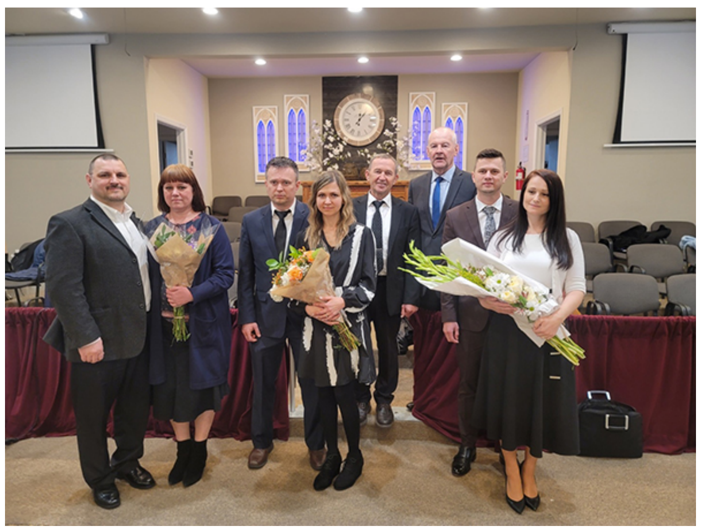
New ministers and their wives