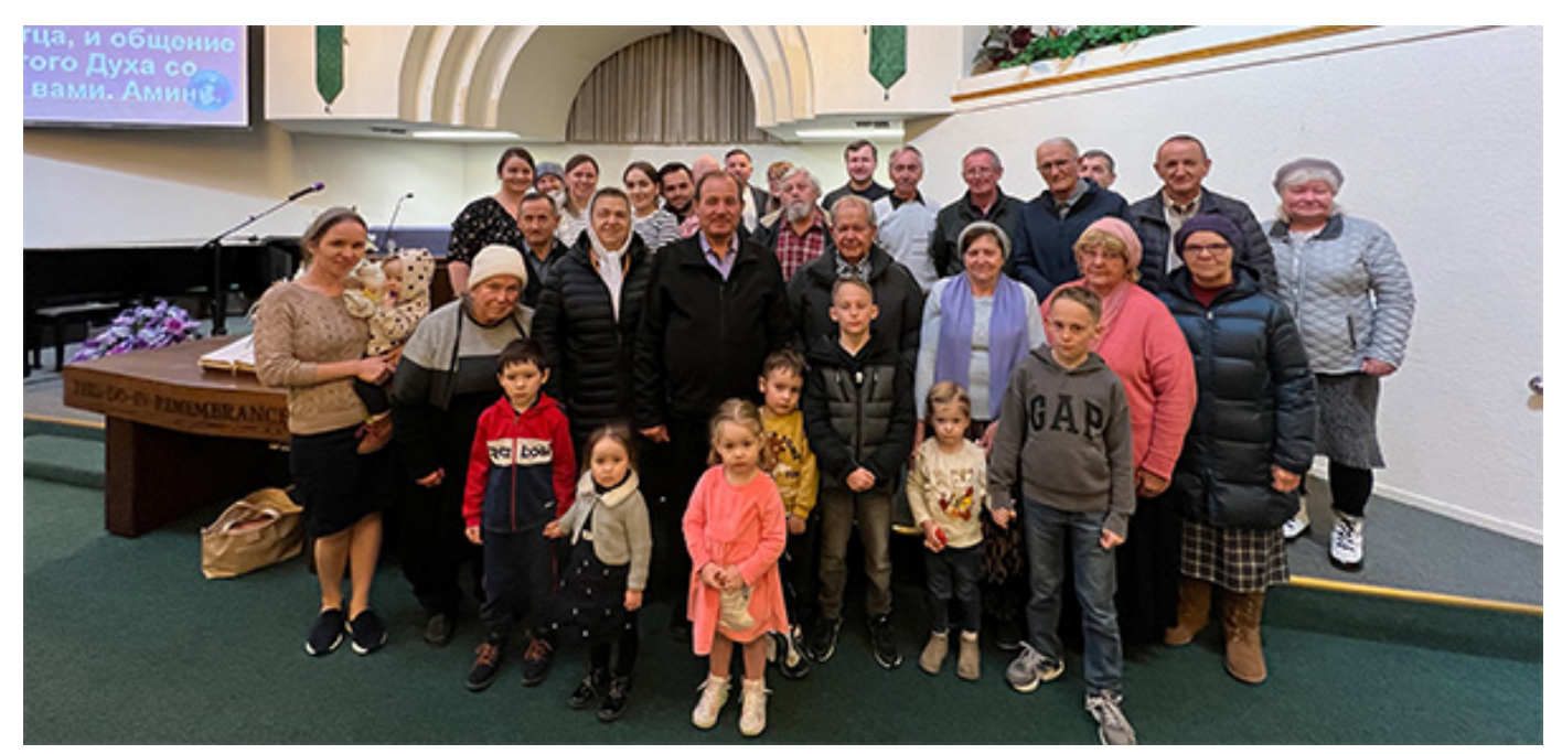
Word of Life Church