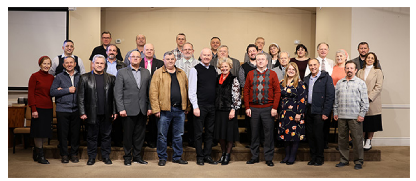
Pastors and their wives who attended the meeting in West Sacramento

A similar meeting also took place on March 11 in Montebello for the pastors of the southern region. Read about it here.