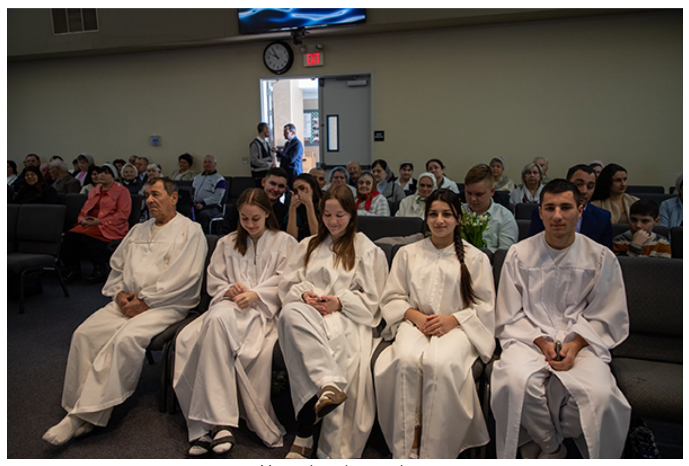
New church members