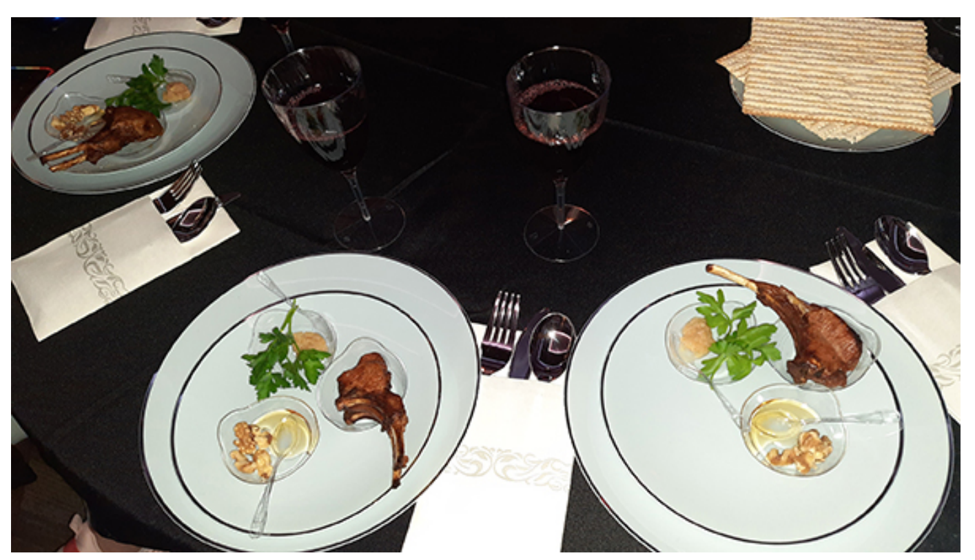
Symbolic Passover meal: bitter herbs as a symbol of the slavery of the Israelites in Egypt, sweet honey as a symbol of a future life with God, and a rib of lamb as a symbol of the sacrifice of Christ.