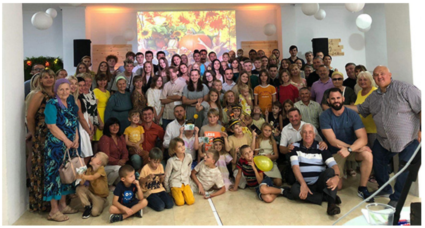
The church is growing, and the place of worship is becoming more packed...