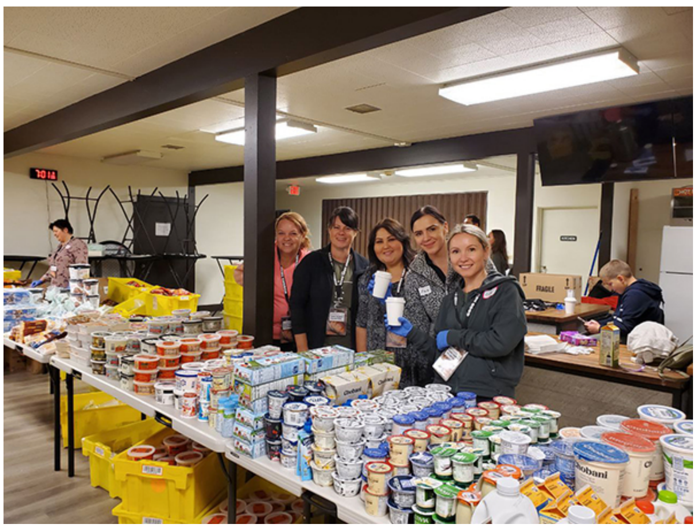
Church Volunteers Serve at the Food Bank