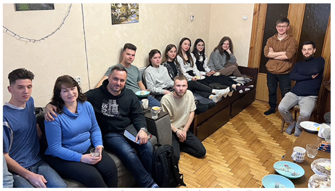
Meeting with the youth of a small group of refugees from Eastern Ukraine