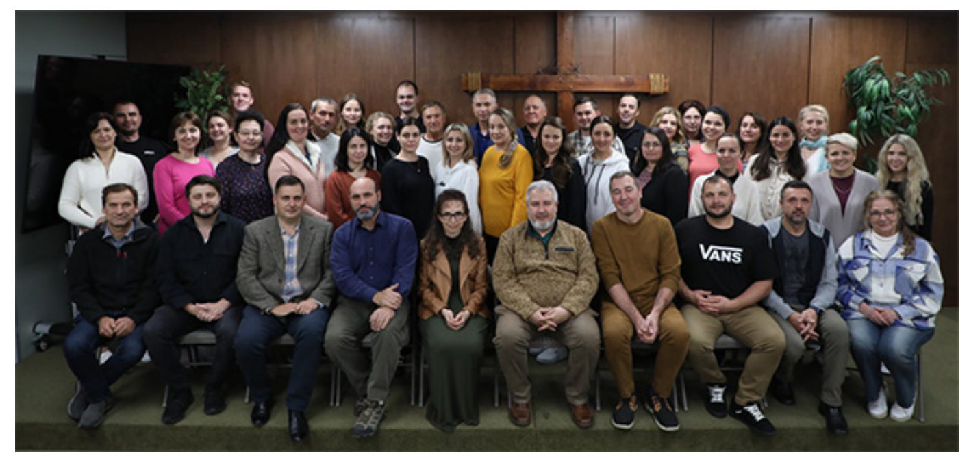
Traditional photo at the End of the Session