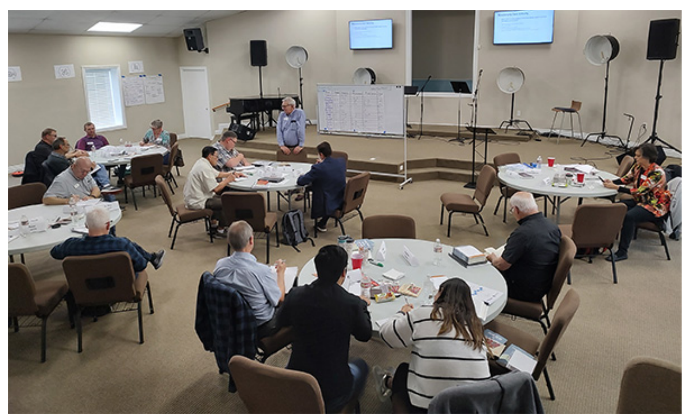
During the Training