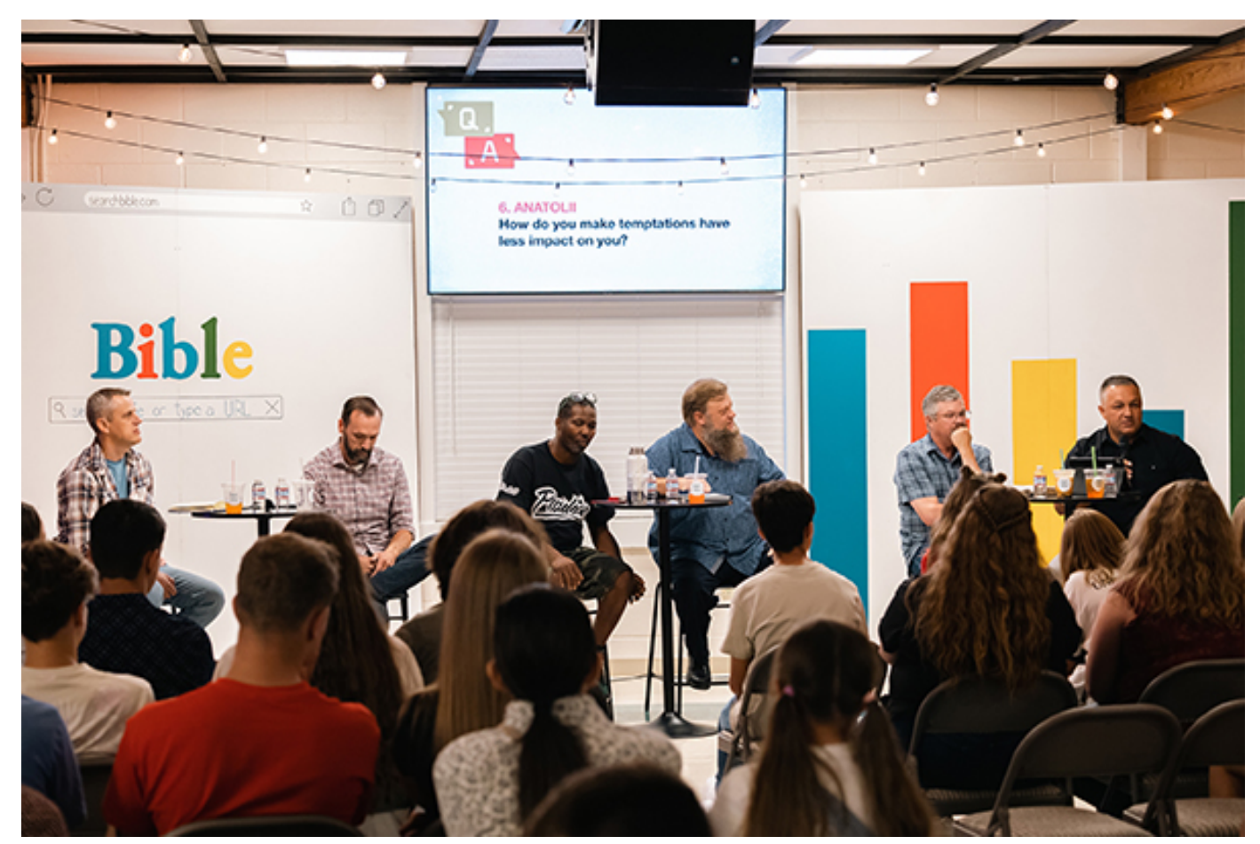
Speakers Answering the Youth's Questions

The New Hope Church has been doing "Bible and Boba" meetings since March 27, 2021. The main goal of these meetings is to motivate more youth, and especially those who are unbelieving, to hear the Word of God, and to fall in love with it. The meetings take place four times a year and are attended by between 100 and 150 people. The next meeting is scheduled for August 26, 2023. For more, click here (in Russian only.)