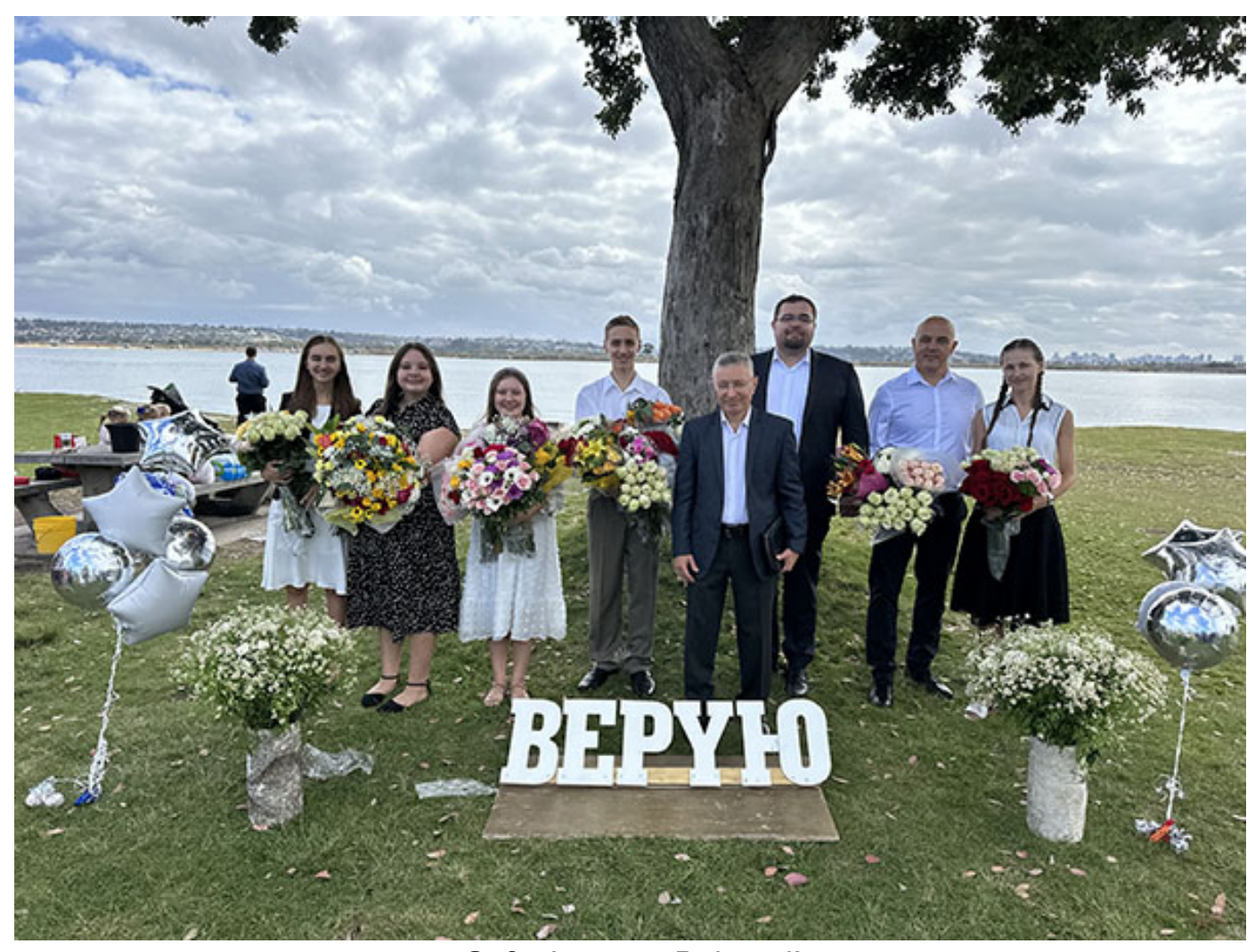
Safe Journey, Beloved!