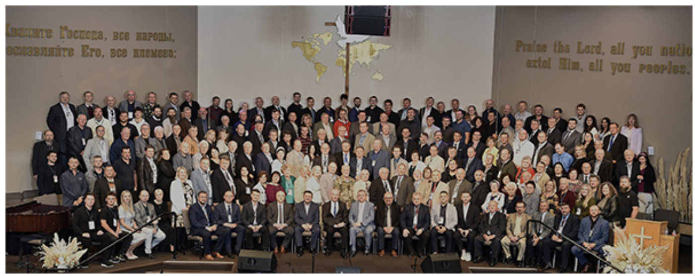
The Conclusion of the Convention - Group Picture

CONGRATULATIONS TO THE CHURCHES WITH ANNIVERSARIES