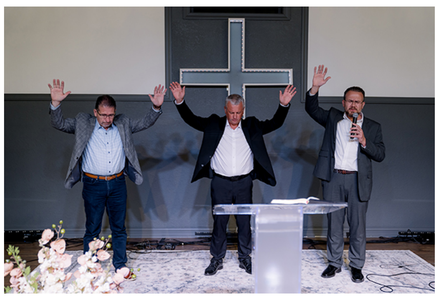
Prayer of Dedication

God miraculously answered this need and these prayers, and helped the church purchase a building on credit that the church had previously rented. On October 8, there was a celebration and a dedication of the church to the Lord. Read more about it in an article by the church pastor, M. Kucherenko (in Russian only).