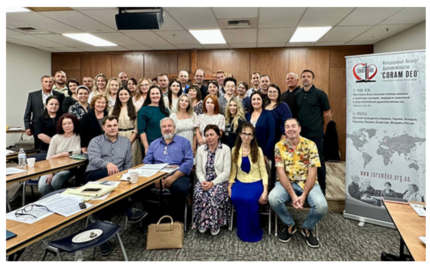
Students and Teachers of the Fourth Module