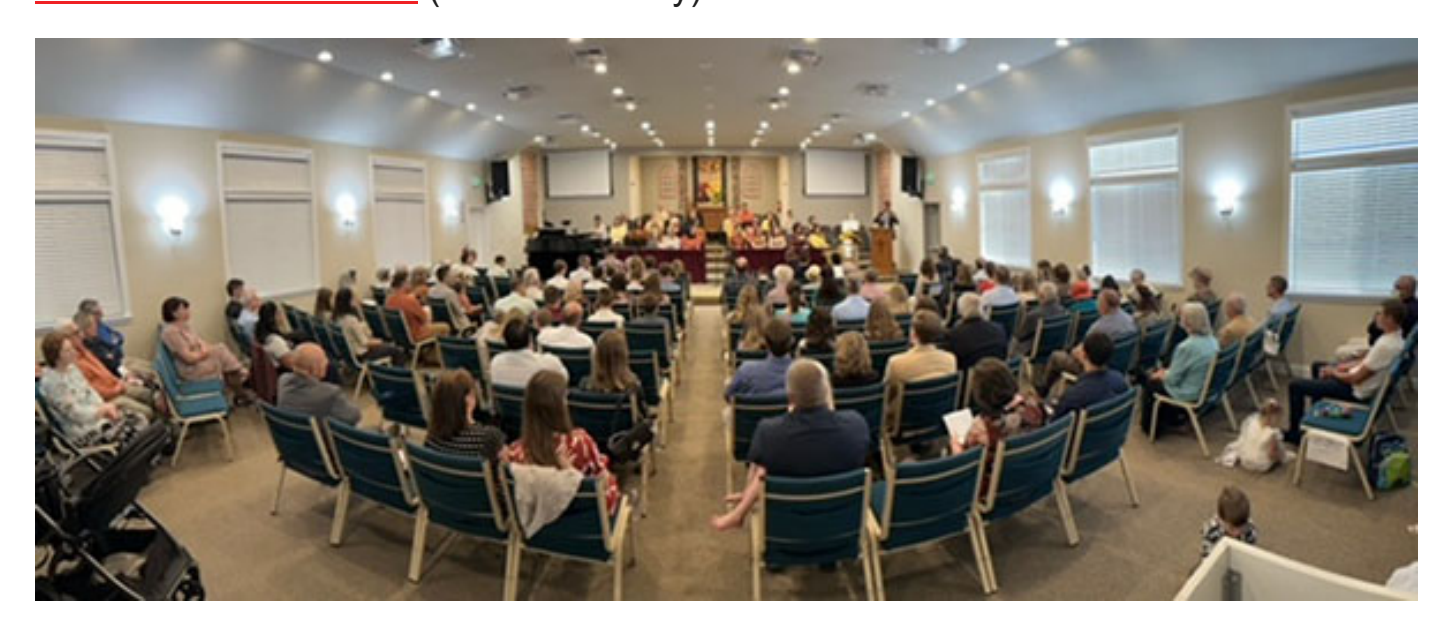
CHRISTMAS GIFTS TO UKRAINE