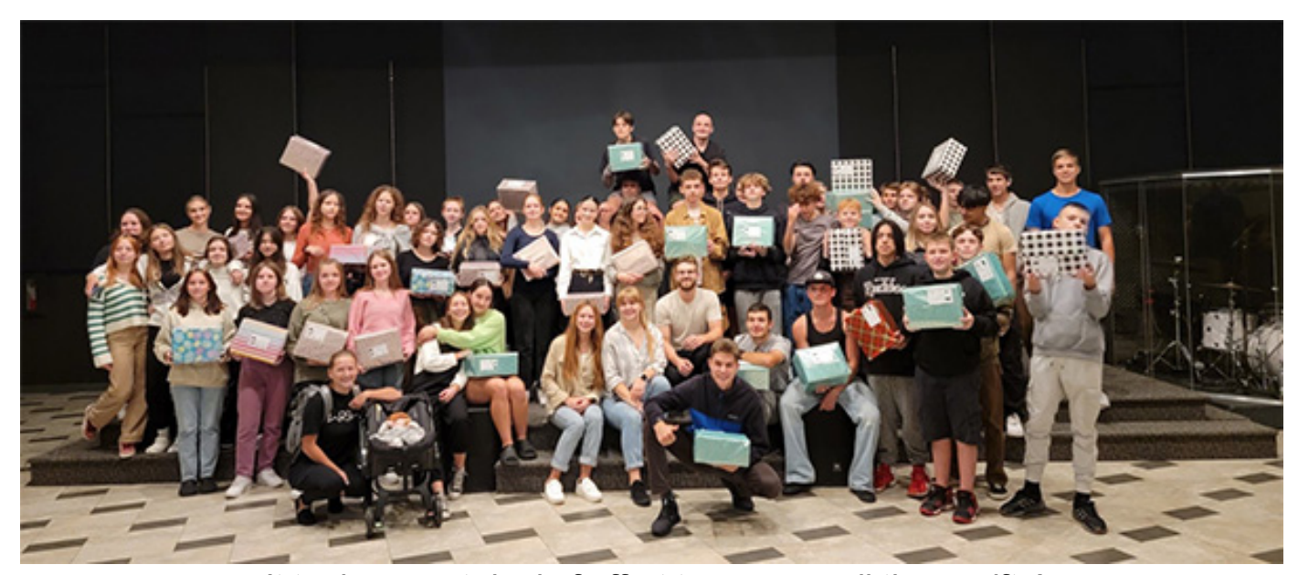
It took a great deal of effort to prepare all these gifts!