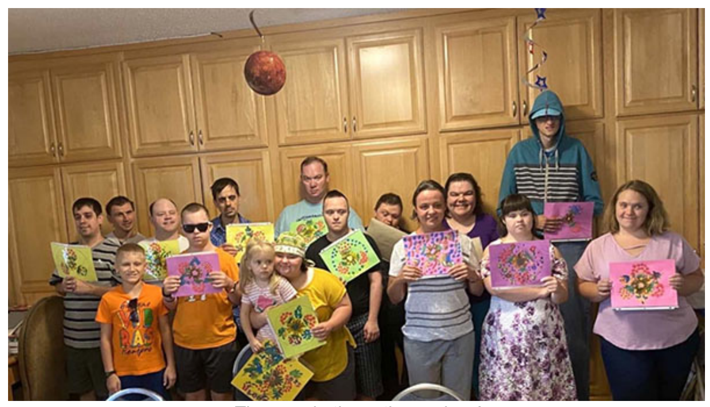
They made these themselves!