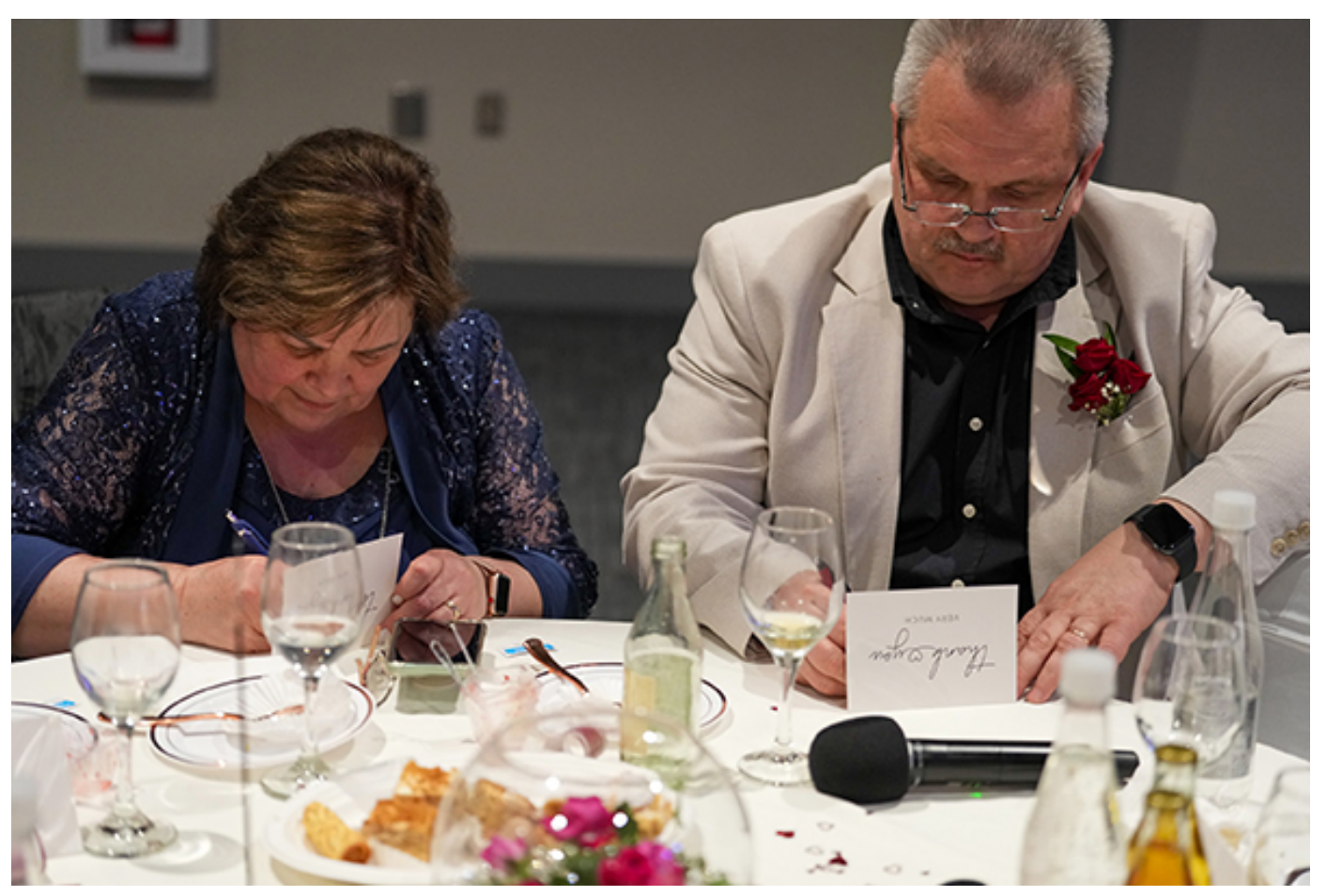
Activity assignment – write a love letter to your spouse