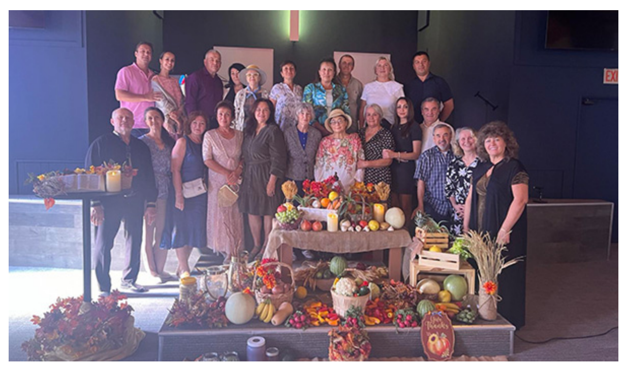
Although there are few of us, this does not diminish the joy of the holiday!