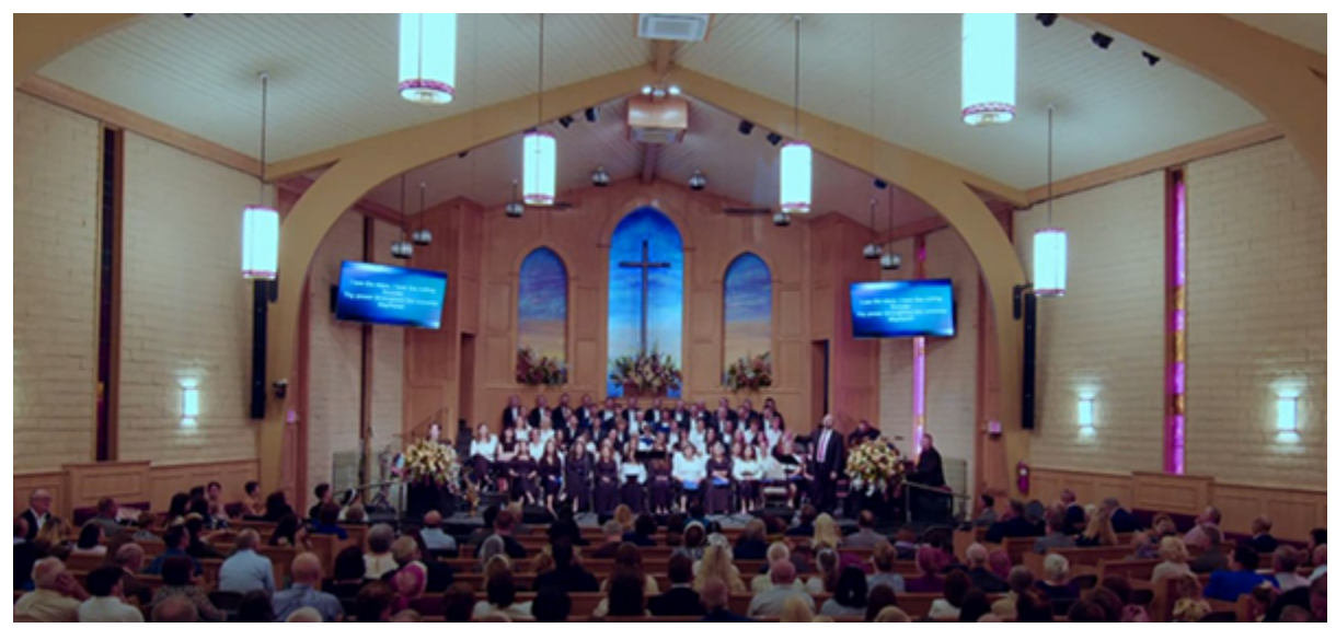
Festive church service

over during the third wave of immigration. The church members and many guests expressed their gratitude to the Lord for the blessings and challenges, trials and concerns, joys and sorrows that the Lord led them through during this entire time. More details... (in Russian only).