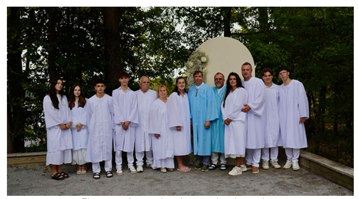
Eleven newly saved souls, new church members

On September 14, the churches of South Carolina experienced a wonderful event that affected two of the local Spring of Life Churches in Greenville and Anderson. They had a water baptism service for eleven people who publicly professed their faith in Jesus Christ and declared Him to be their personal Lord and Savior. More details... (in Russian only).