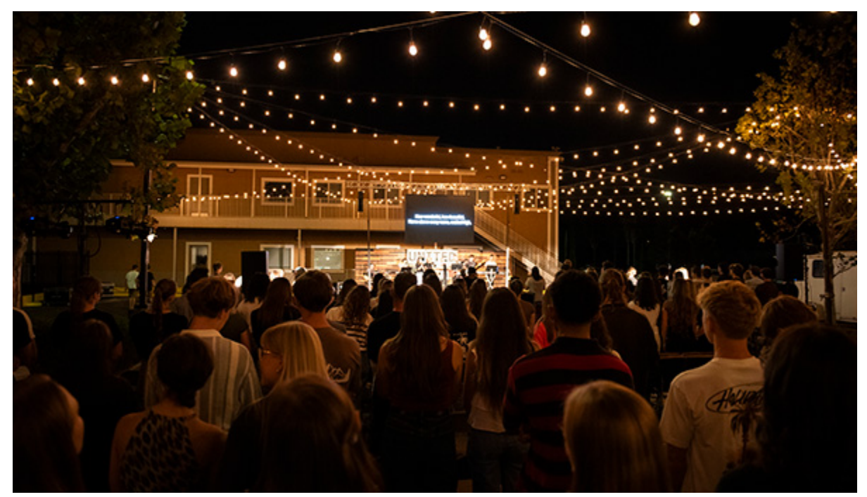
During the Worship Night