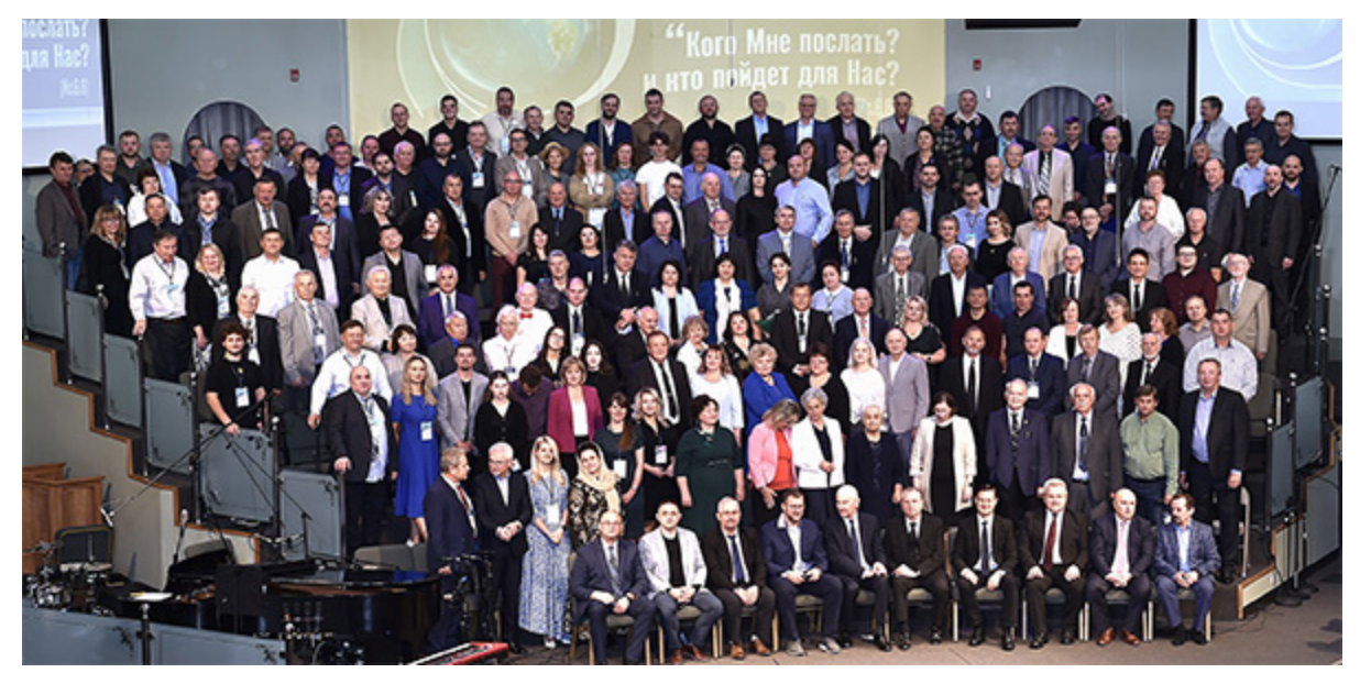
Photo of the convention delegates and the leadership of the Association