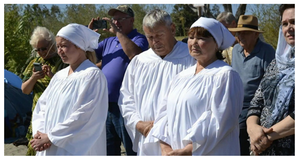
Praise God for those who are being saved by Jesus Christ!