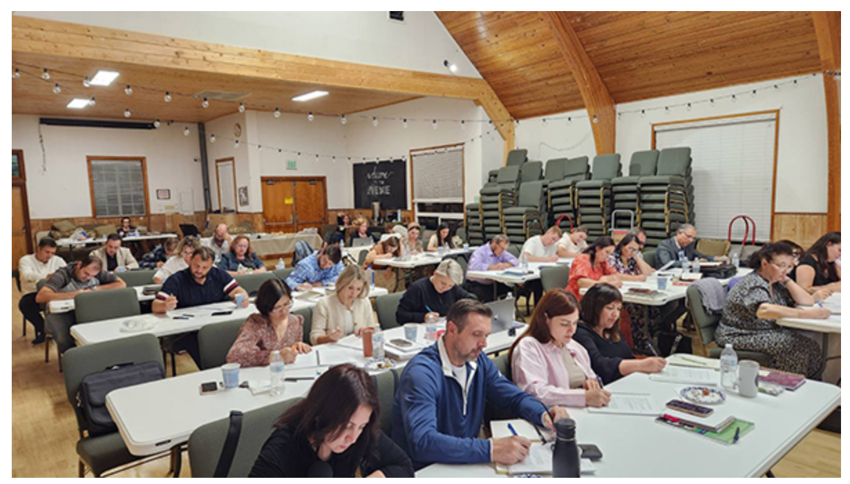
Over thirty people continue to study under the "Coram Deo" program