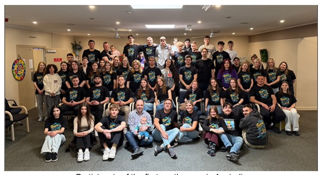
Participants of the first youth camp in Australia