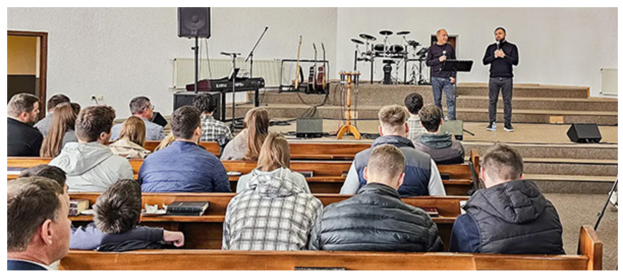
During the conference...

very first conference for those who are serving in the information ministry. The conference had 80 representatives from various regions of the country who are engaged in marketing the churches online through social media, websites, chatrooms, video channels, as well as those who assist in live streaming the church services. Click this link for more about the conference – "Church and Social Media – new challenges and new opportunities"... (in Russian only).