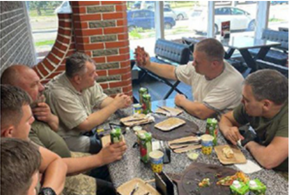
Preaching the Gospel to those in the military